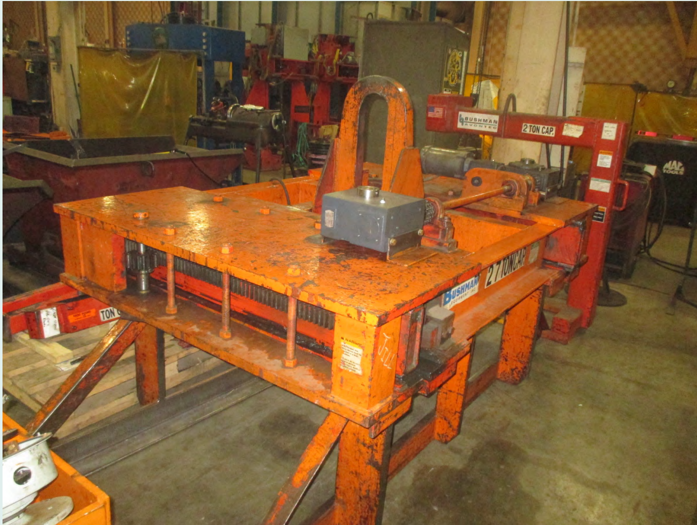
Bushman Model M5600 Sheet Lifter