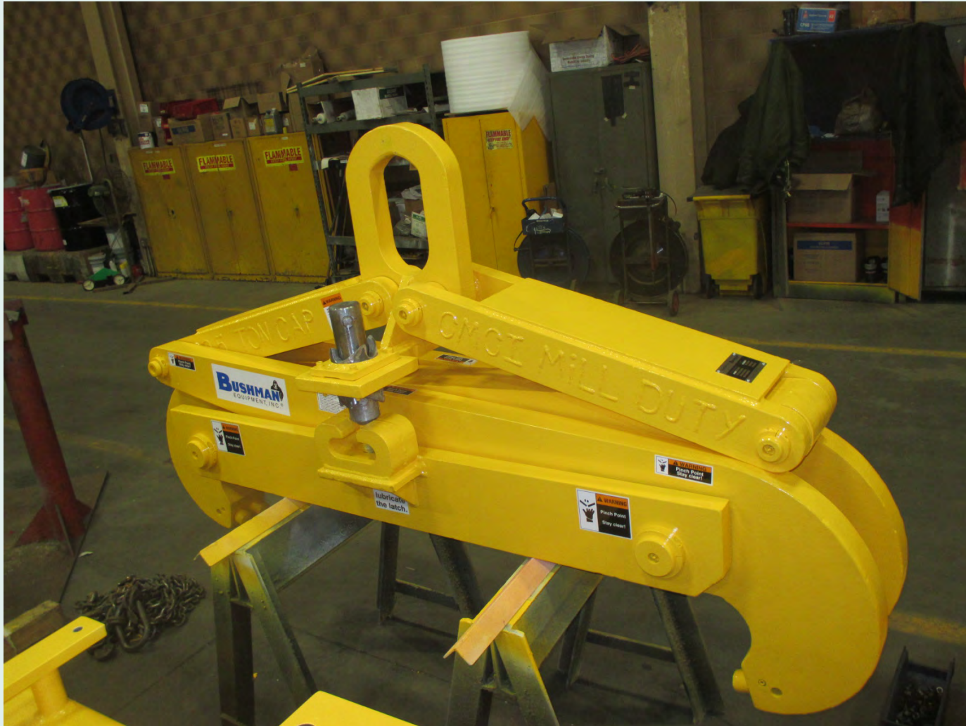
CMCI Lifting Tong