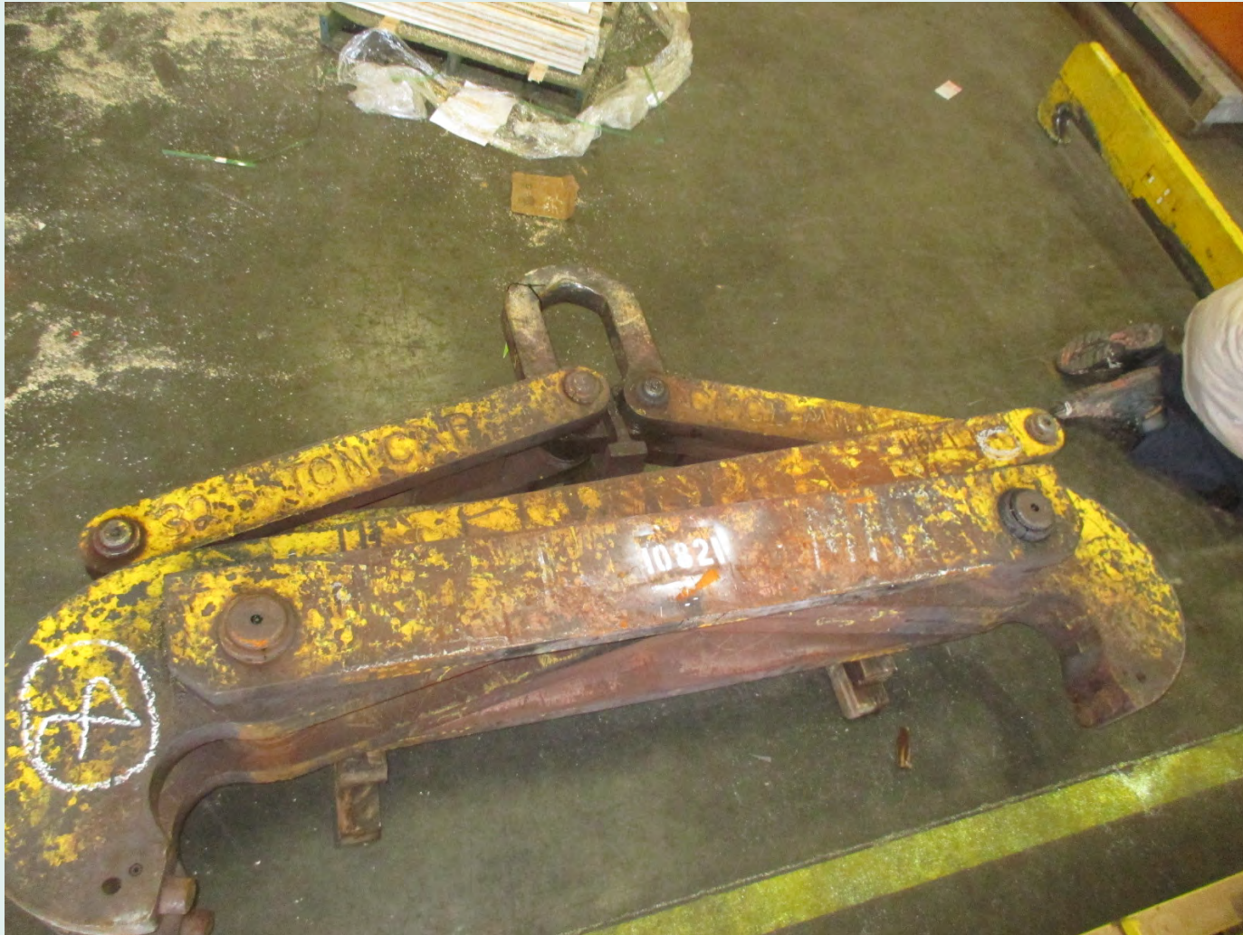
CMCI Lifting Tong