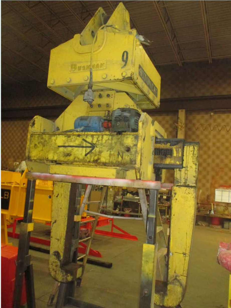
Bushman Model MR5067 Rotating Coil Grab