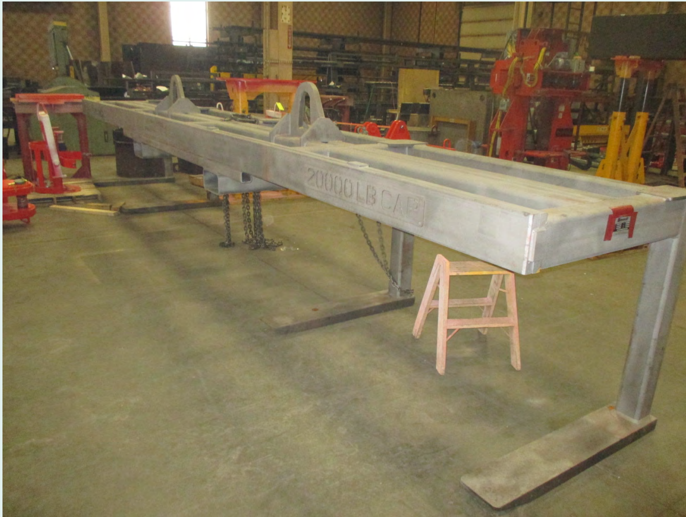
Bushman Model 900 Pallet Lifter