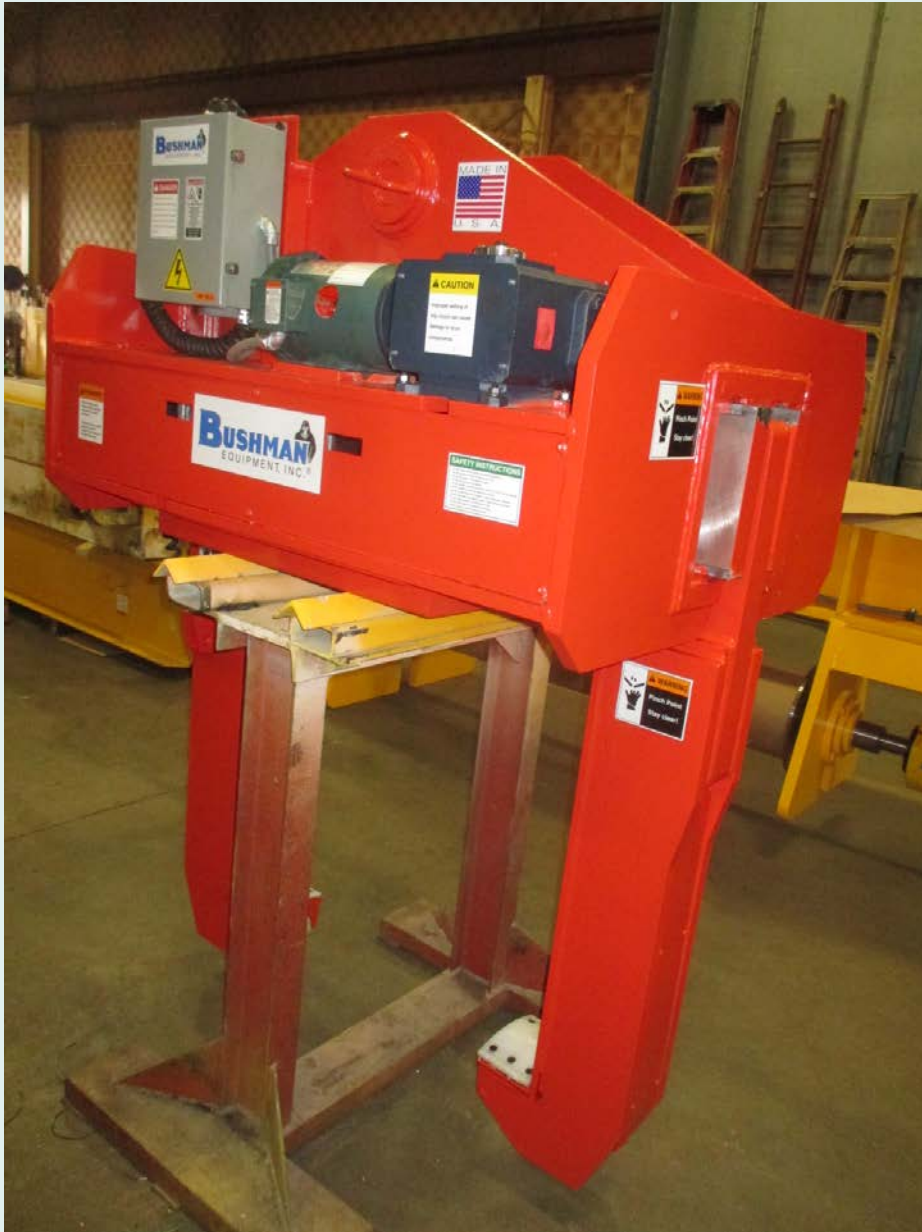
Bushman Model M5067 Rotating Coil Grab