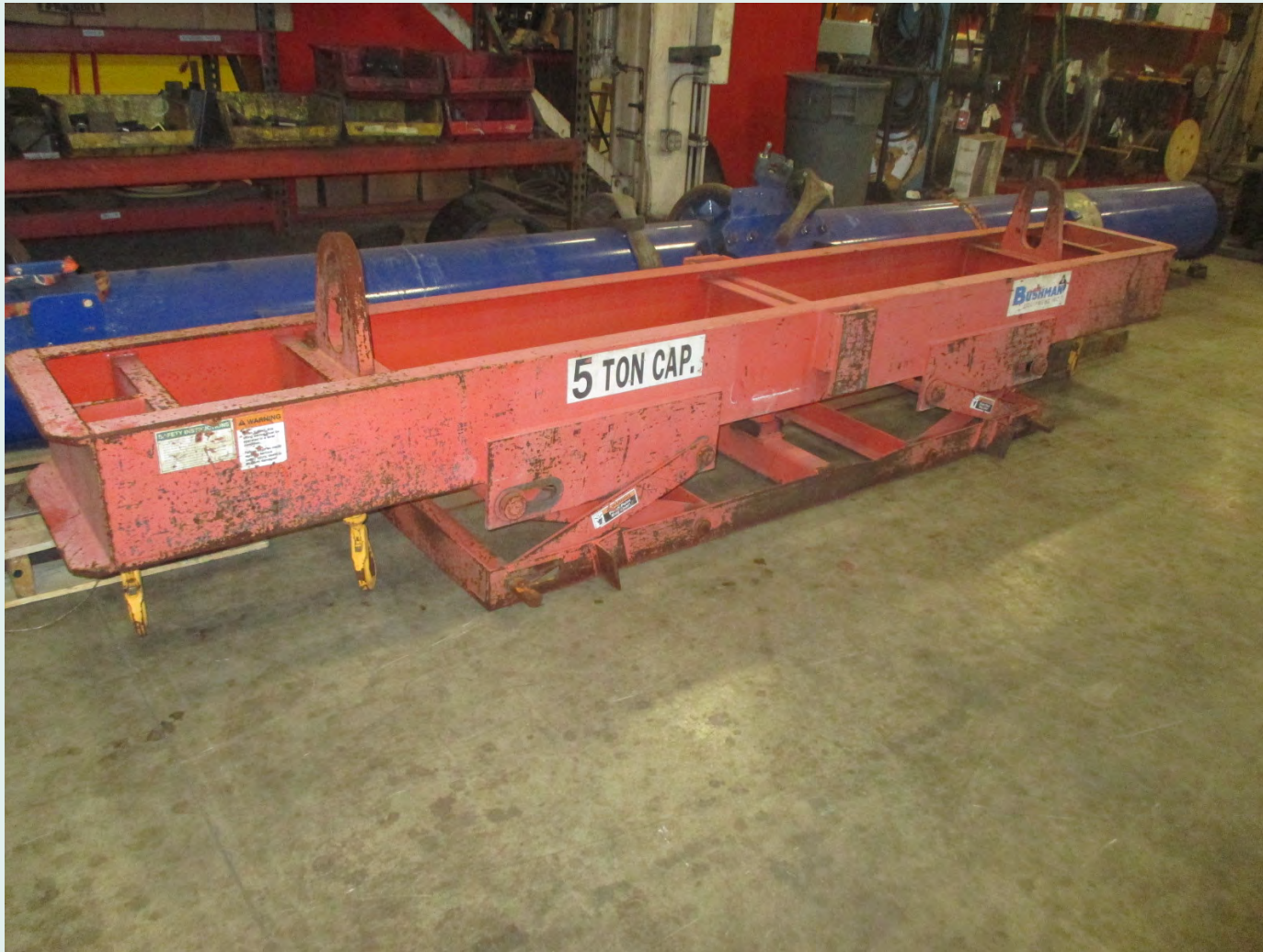
Bushman Bar Rack Grab