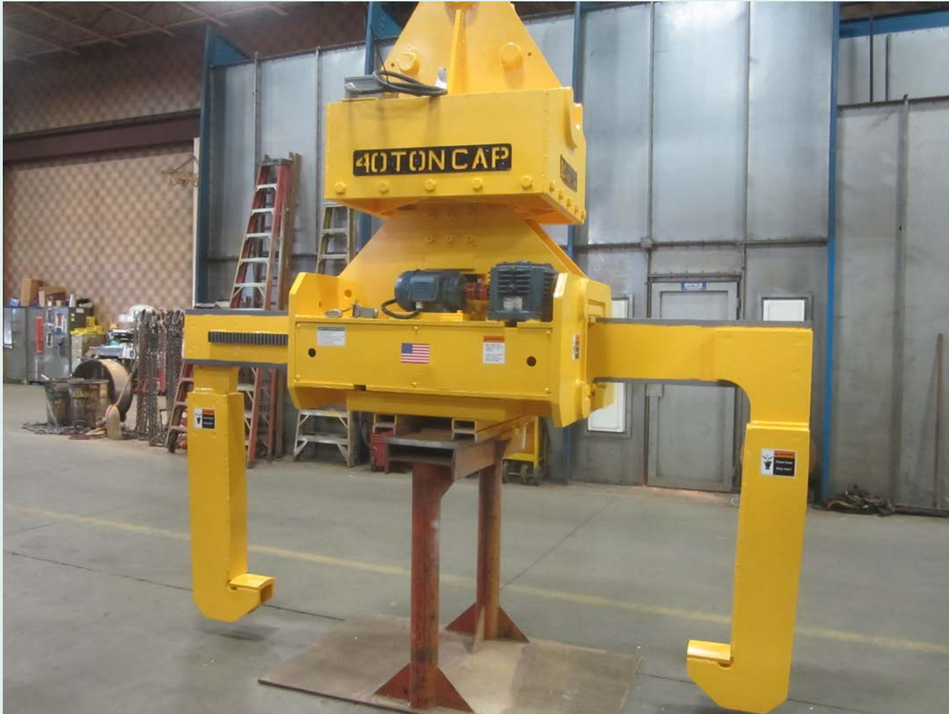
Bushman Model MR5067 Rotating Coil Grab