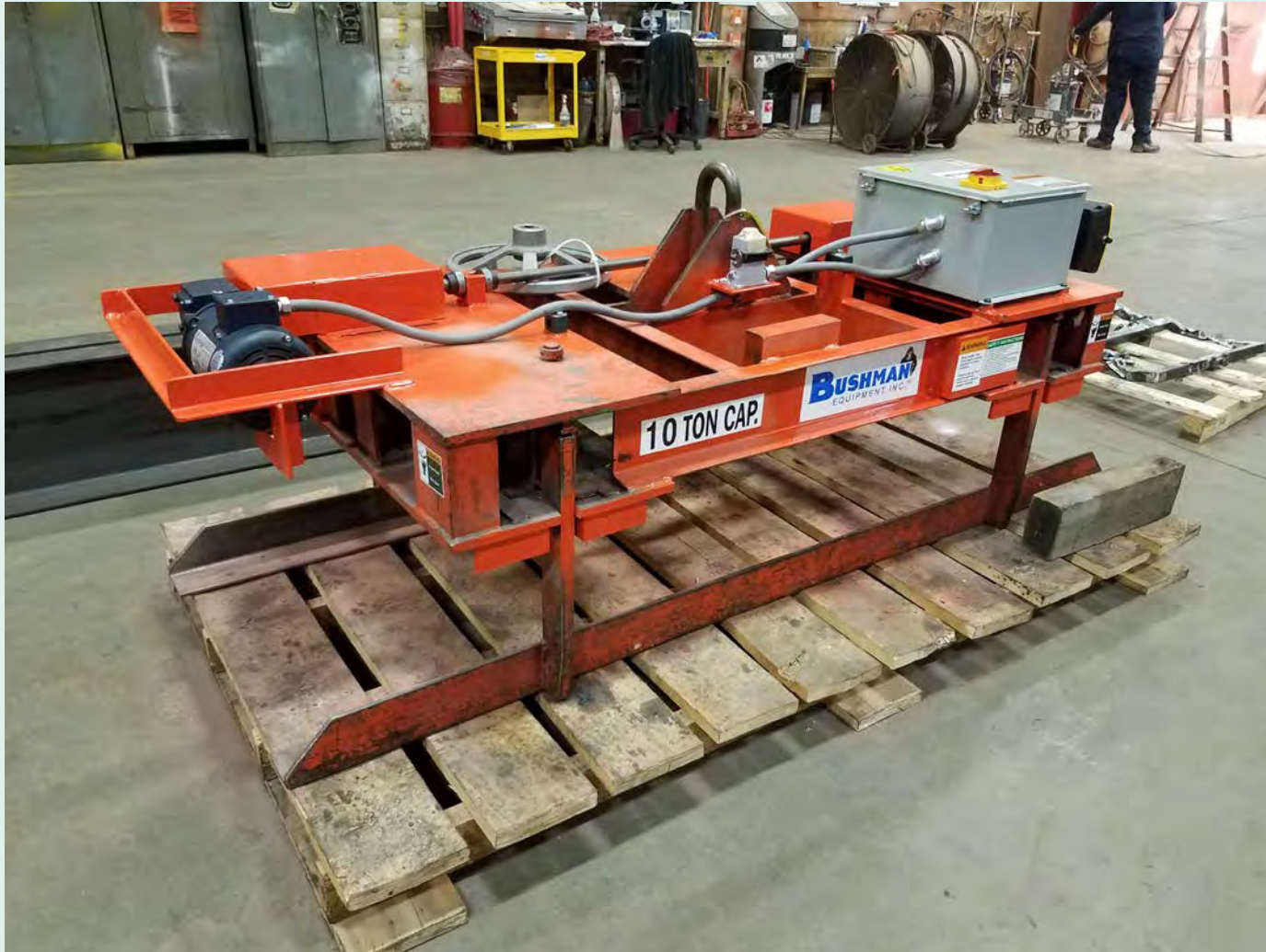
Bushman Model M5600 Sheet Lifter