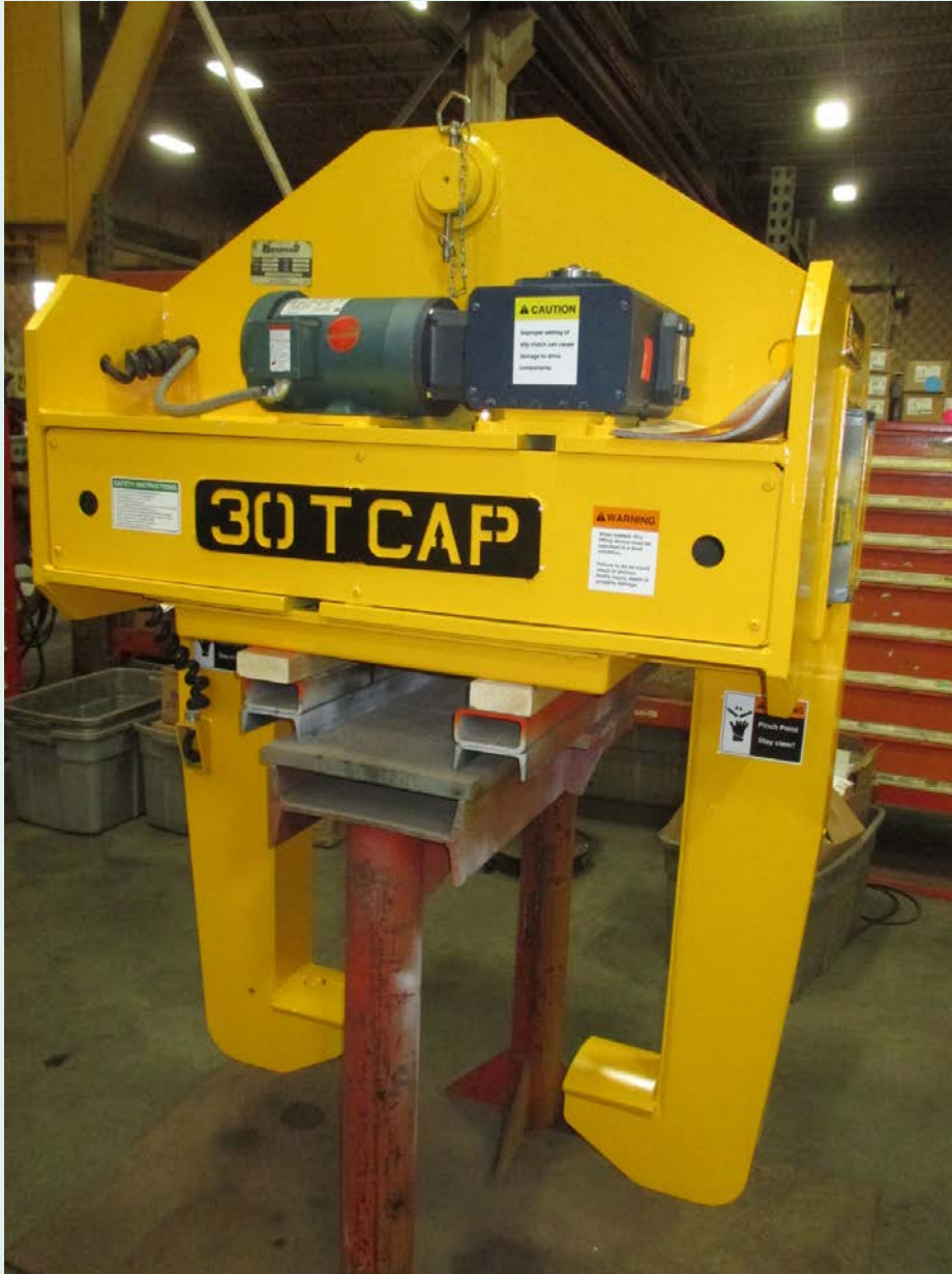
Bushman Model M5067 Coil Grab