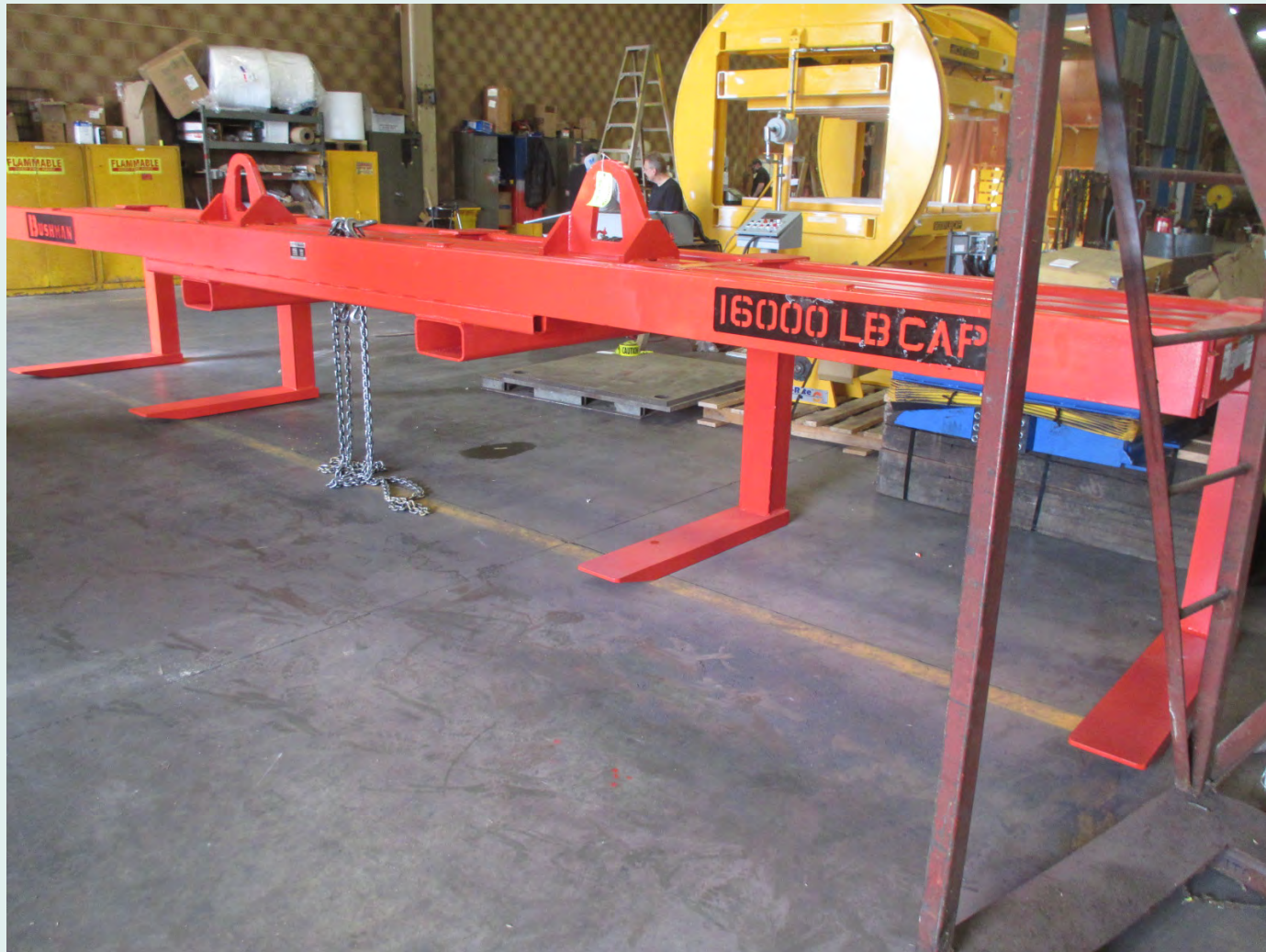
Bushman Model 900 Pallet Lifter