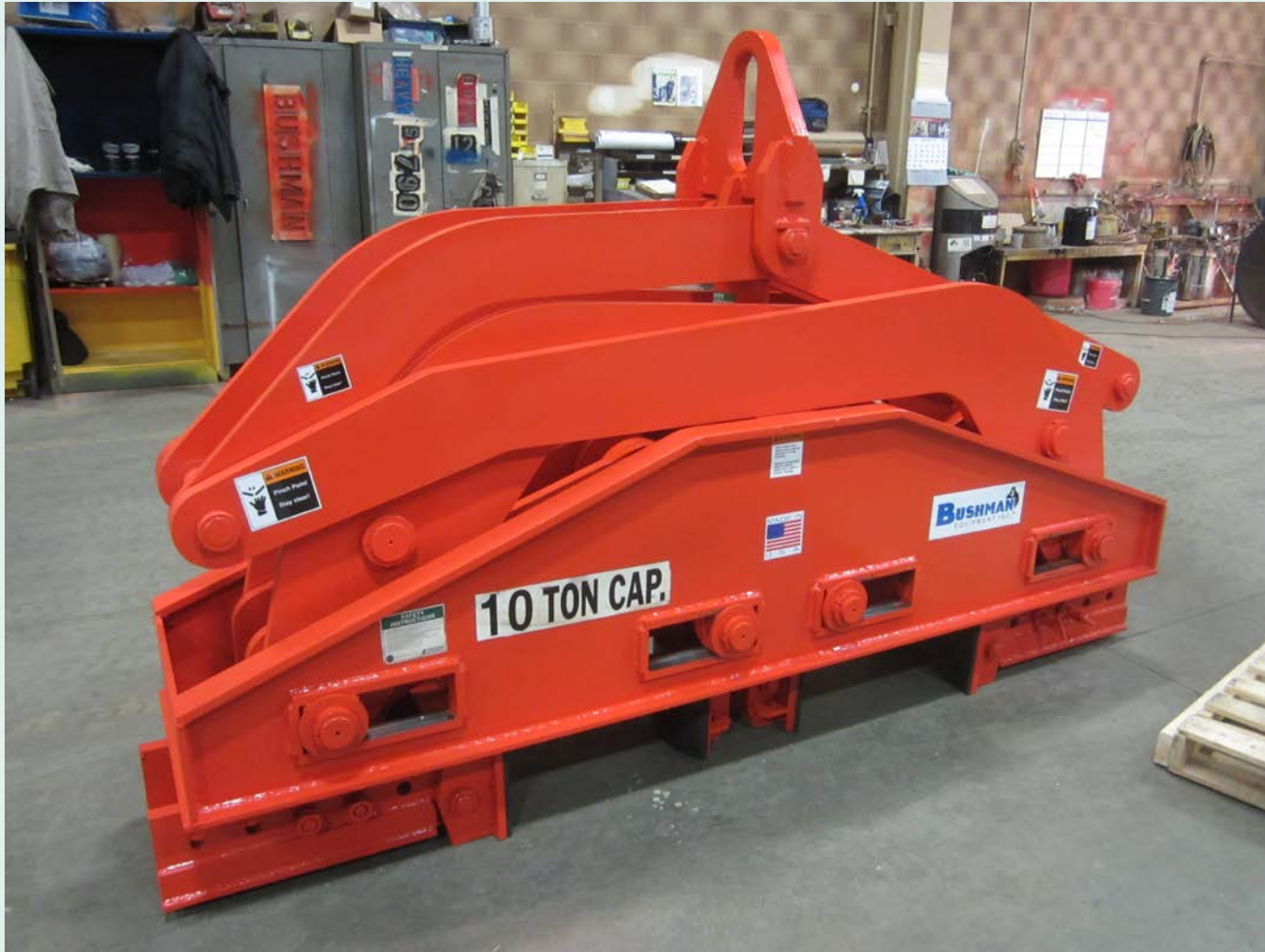
Bushman Model 6107 Double Rim Vertical Coil Tong