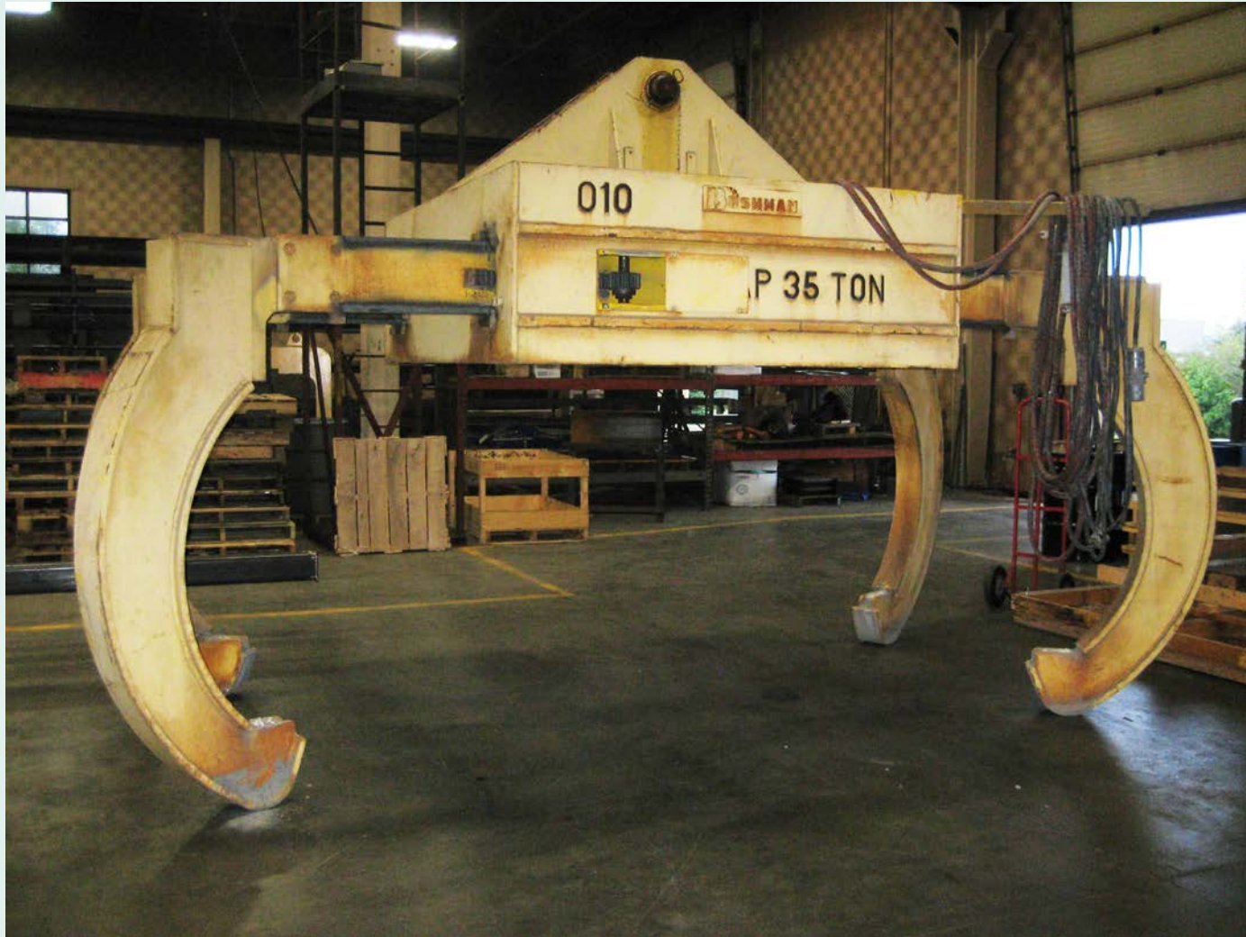
Bushman electrode lifter