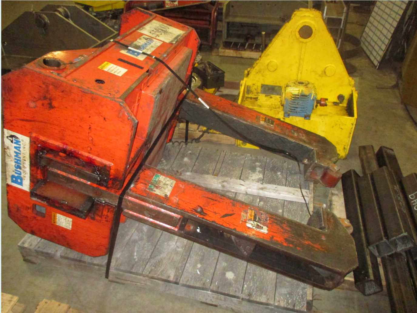
Bushman Model M5067 Coil Grab