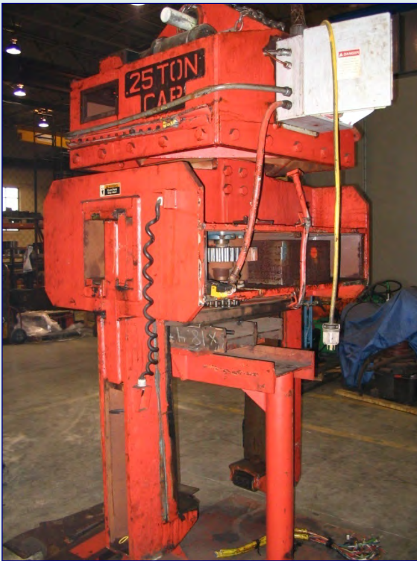
Coil Grab "Before"