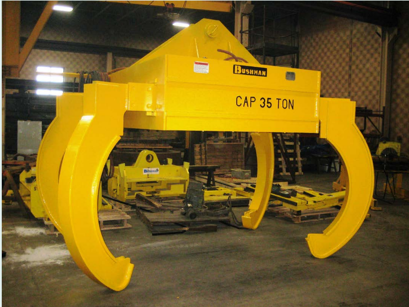
Bushman electrode lifter