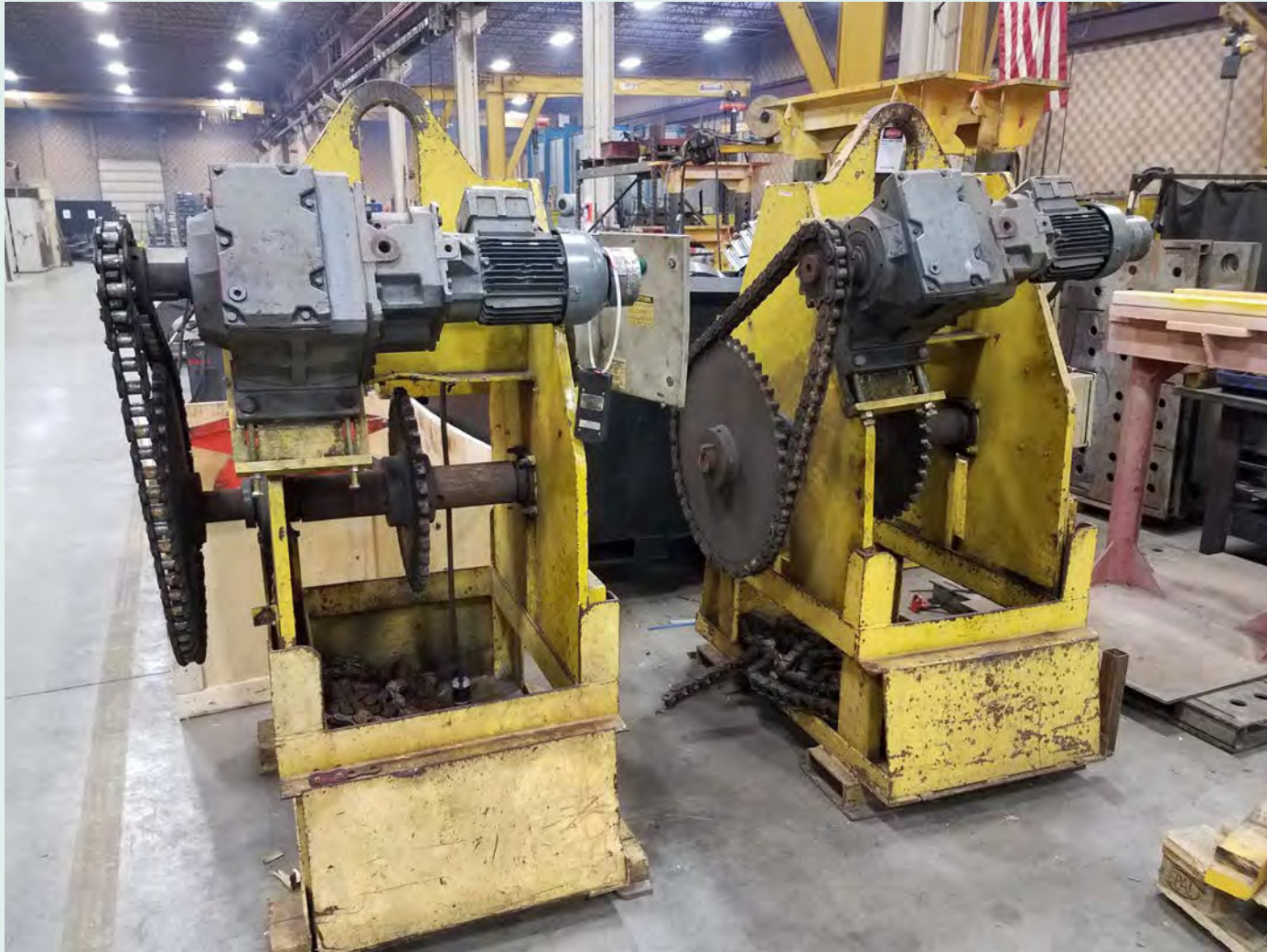
Bushman Flip- Rite® Modules