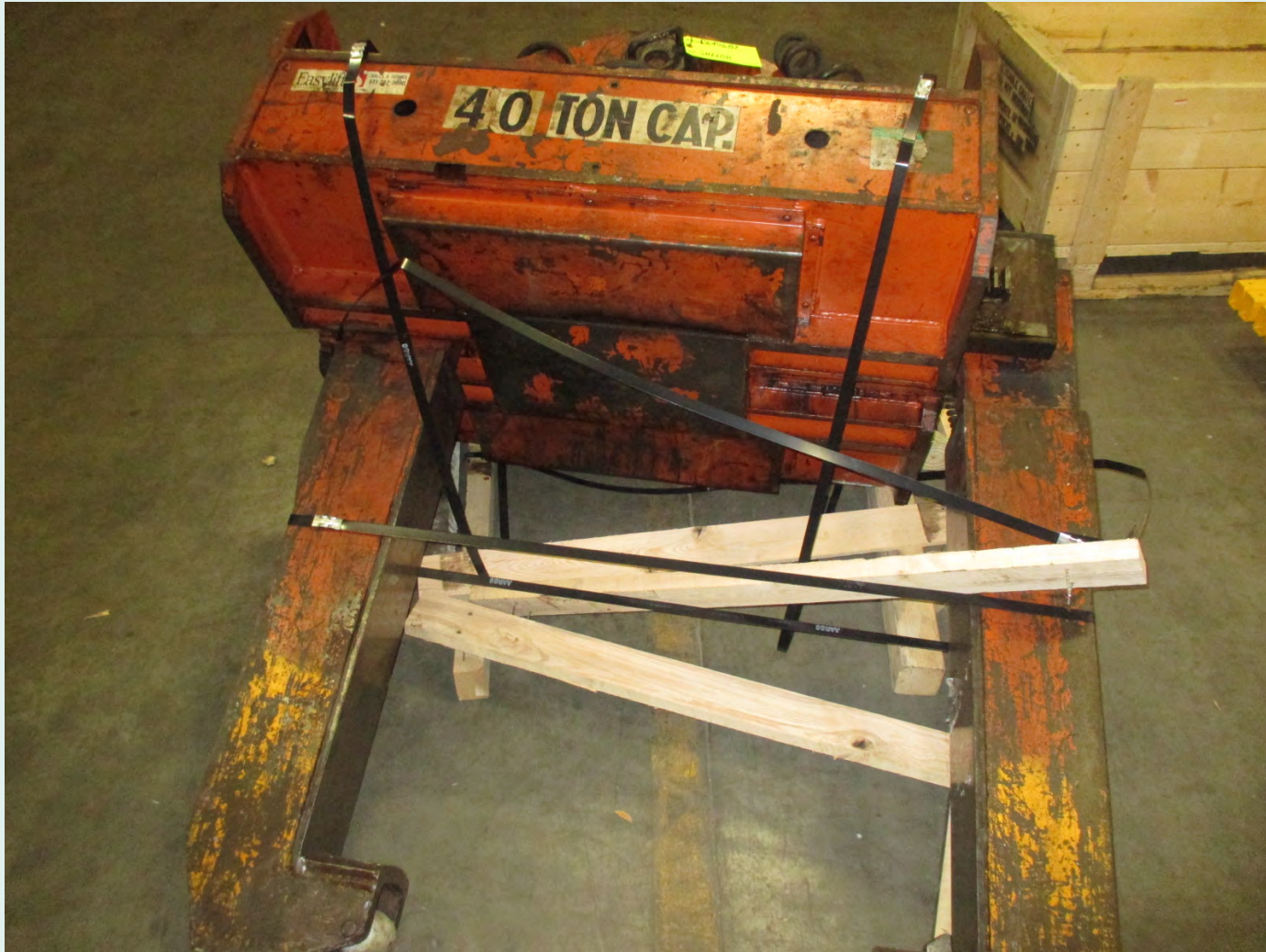
Bushman Model M5067 Coil Grab