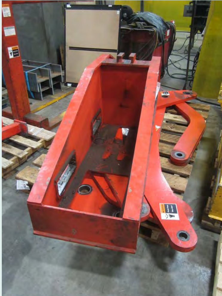
Bushman Model 6107 Double Rim Vertical Coil Tong