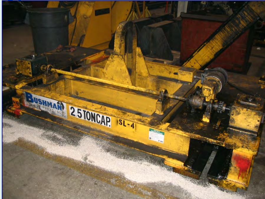
Sheet lifter “Before”