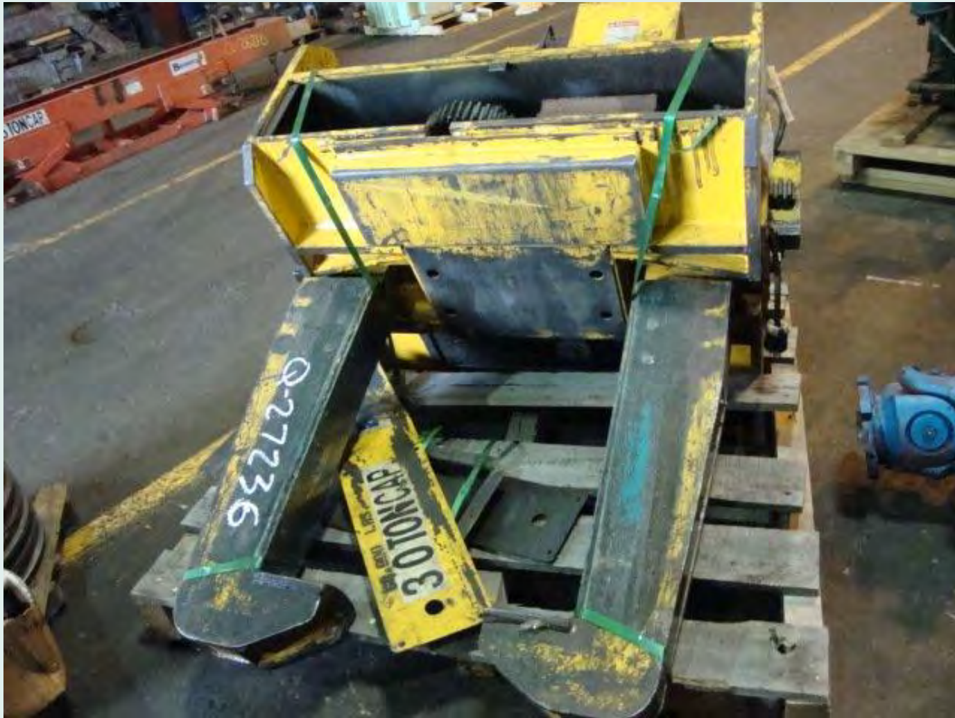
Bushman Model M5067 Coil Grab