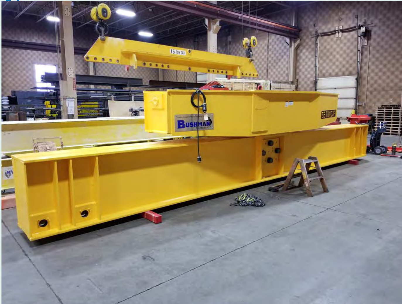
Bushman rotating paper roll beam