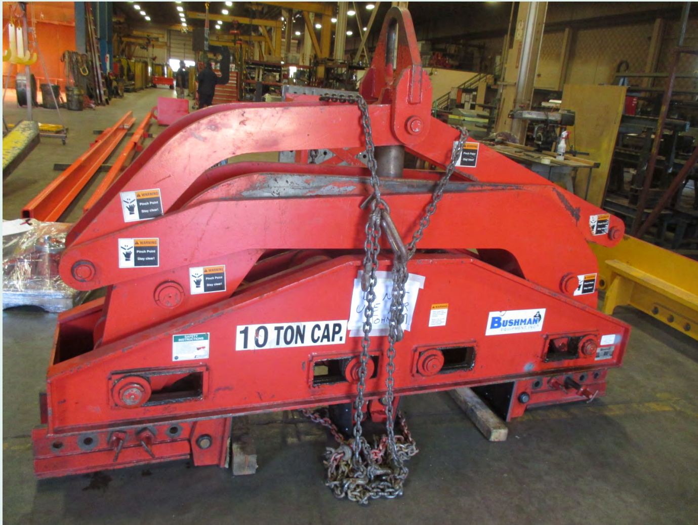
Bushman Model 6107 Double Rim Vertical Coil Tong