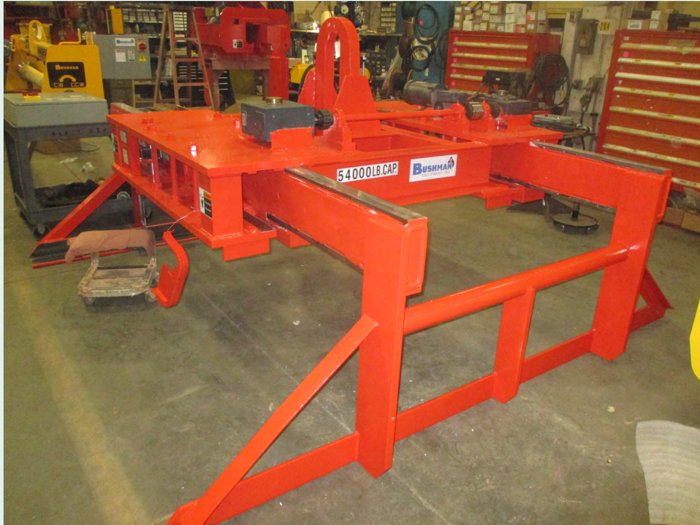
Bushman Model M5600 Sheet Lifter