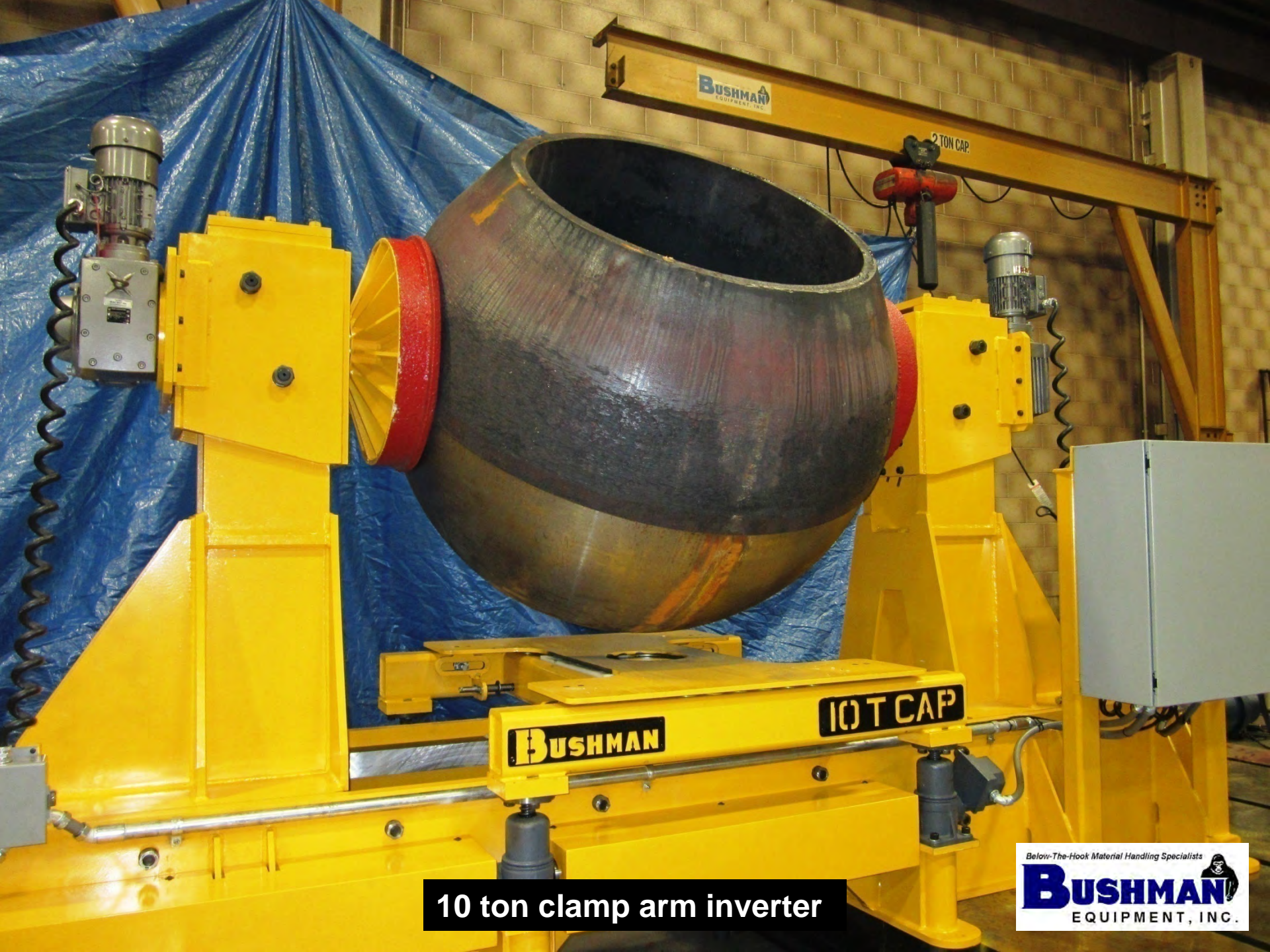
10 ton clamp arm inverter