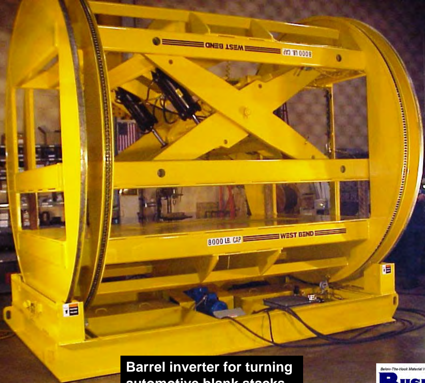
Barrel inverter for turning automotive blank stacks