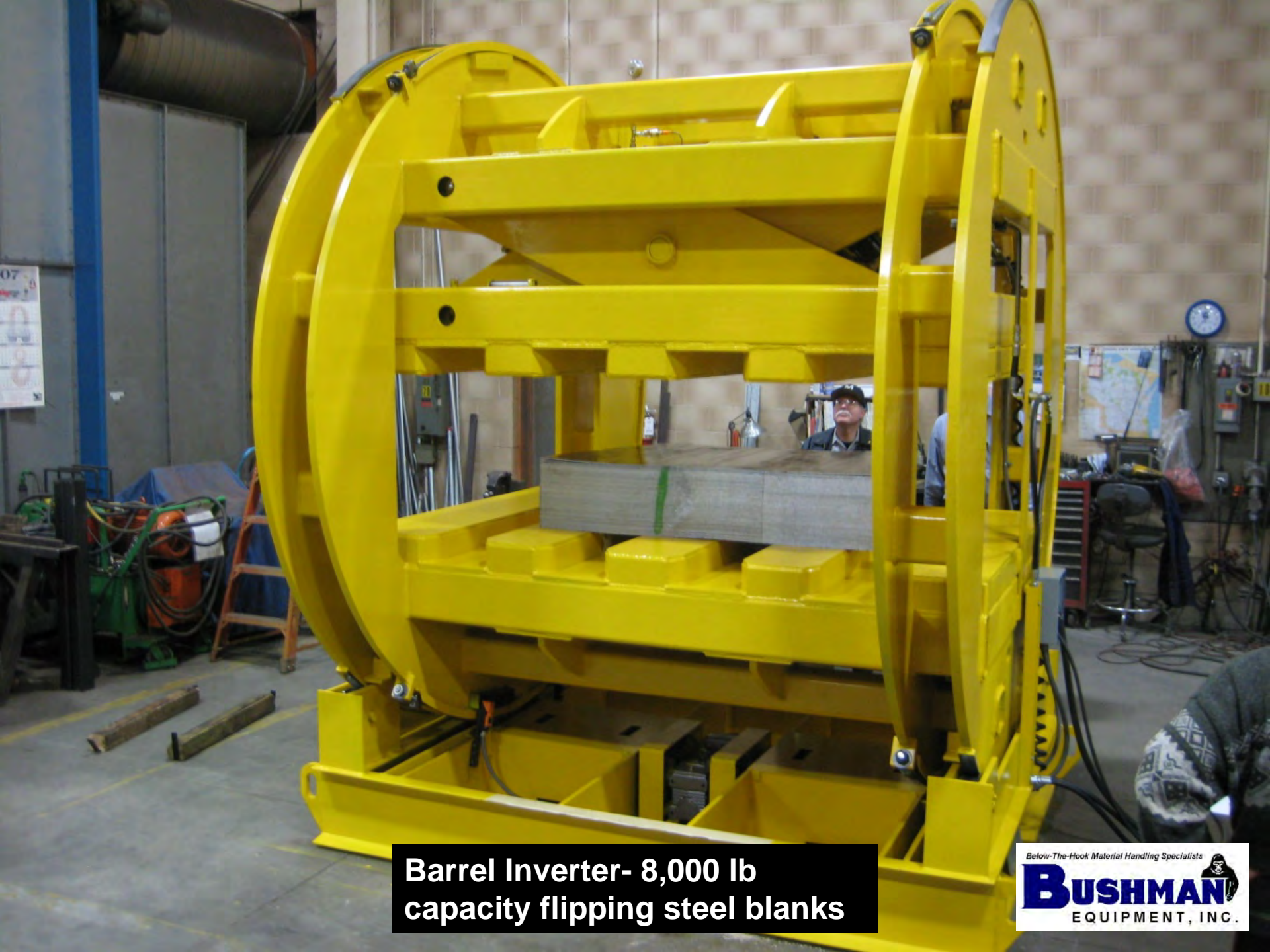
Barrel Inverter- 8,000 lb capacity flipping steel blanks