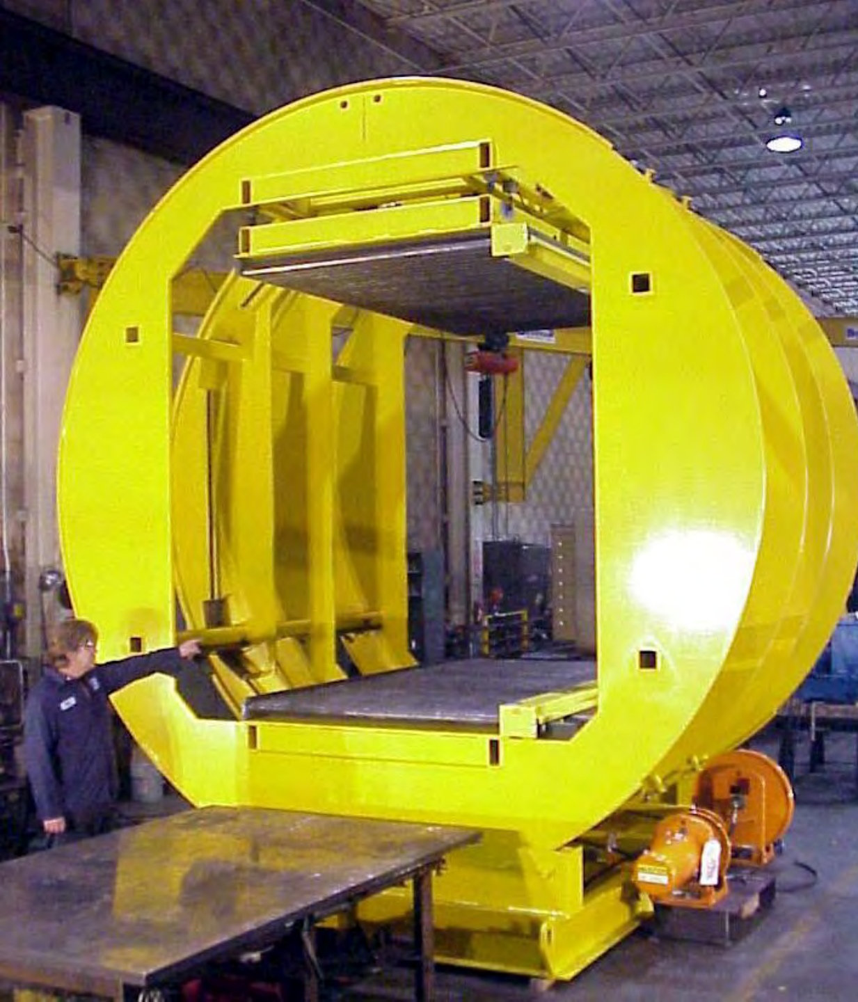
Barrel inverter with powered input & exit conveyors