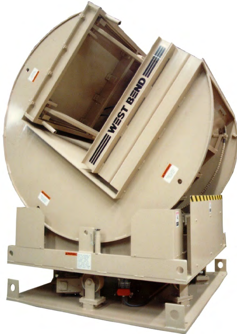
C-Frame inverter with base rotation