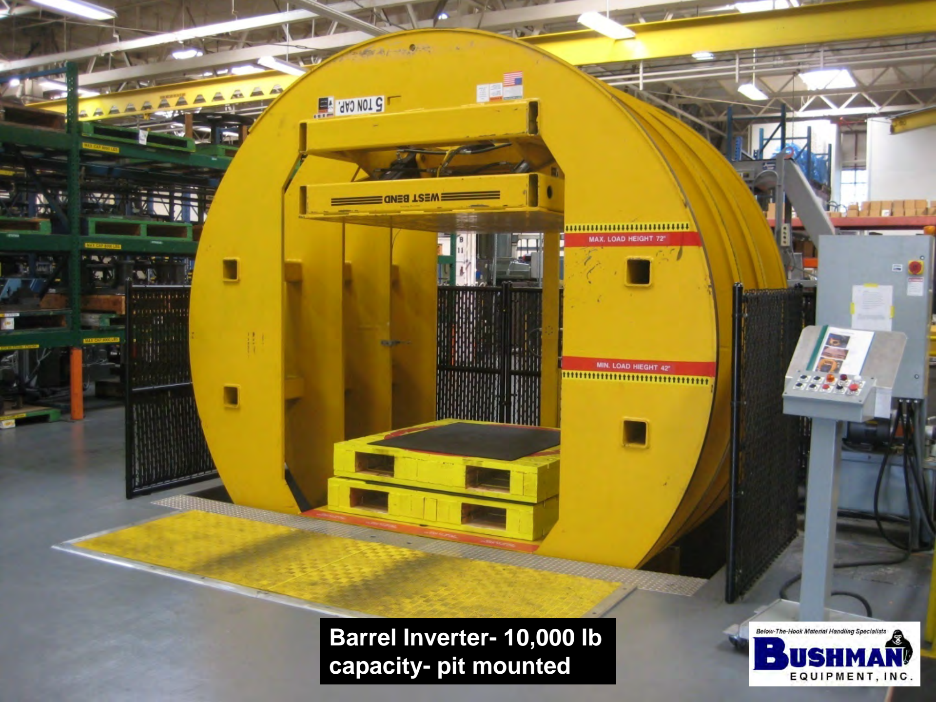
Barrel Inverter- 10,000 lb capacity- pit mounted