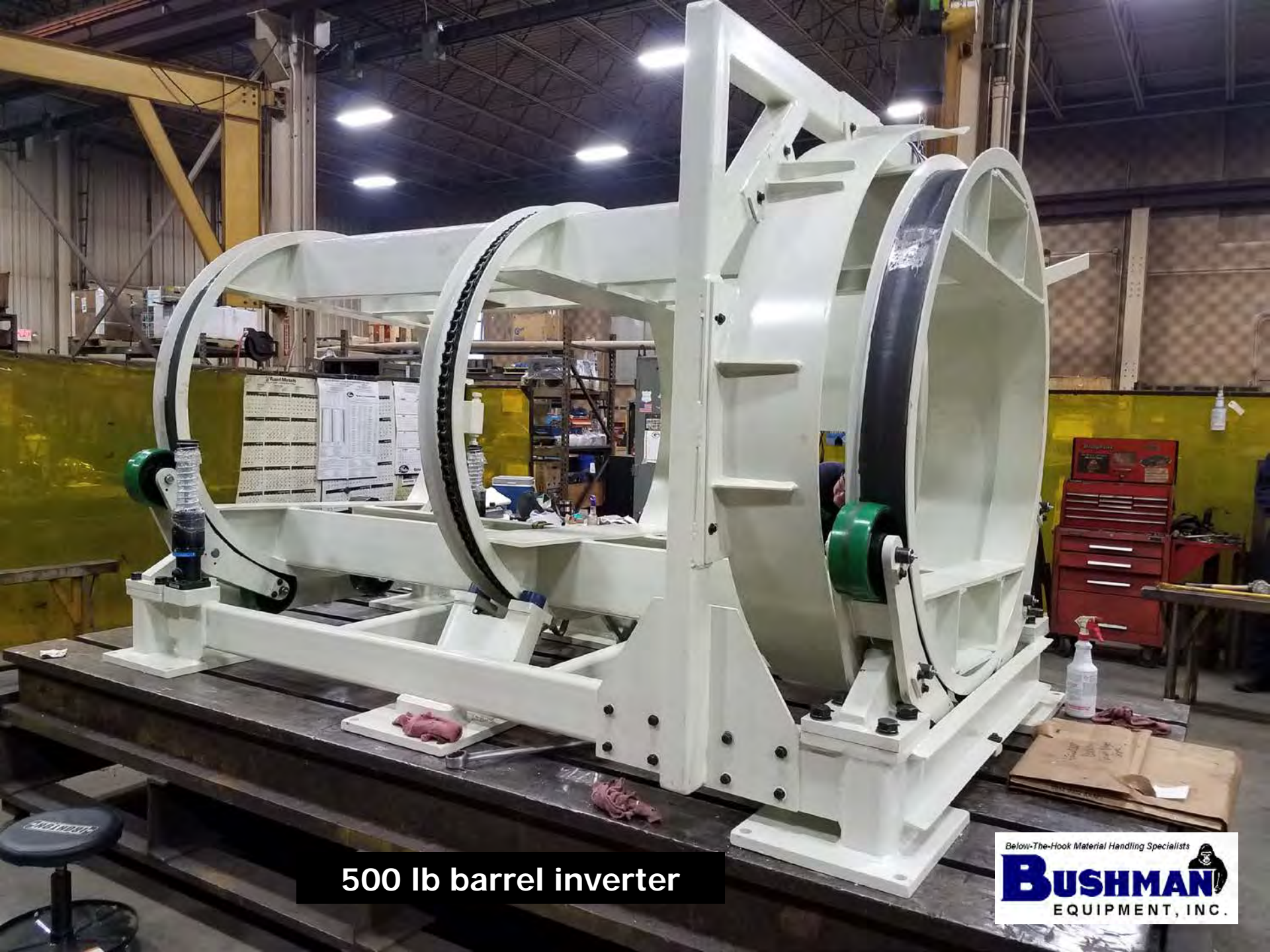
500 lb barrel inverter