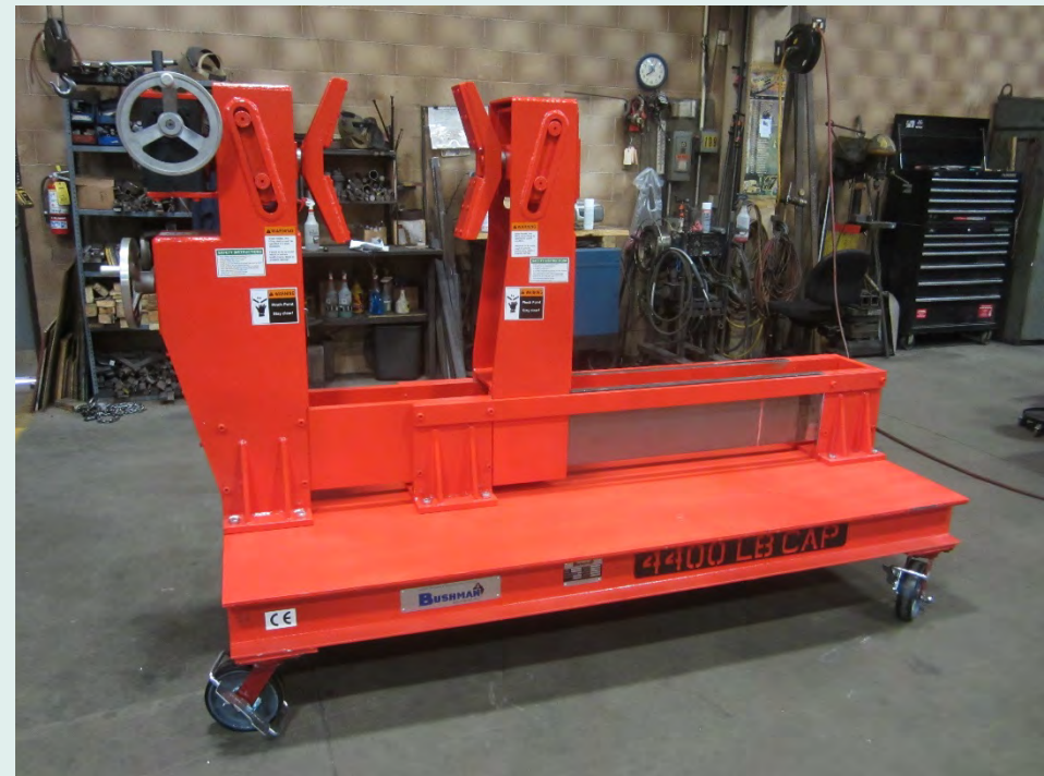
2 metric ton portable clamp-arm inverter