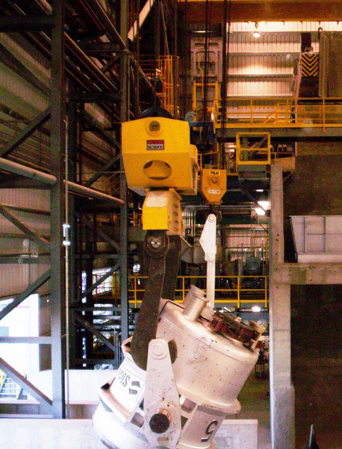
Ladle beam with motorized rotation