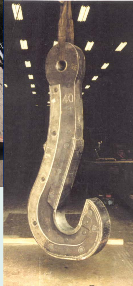
Hooks with metal liners