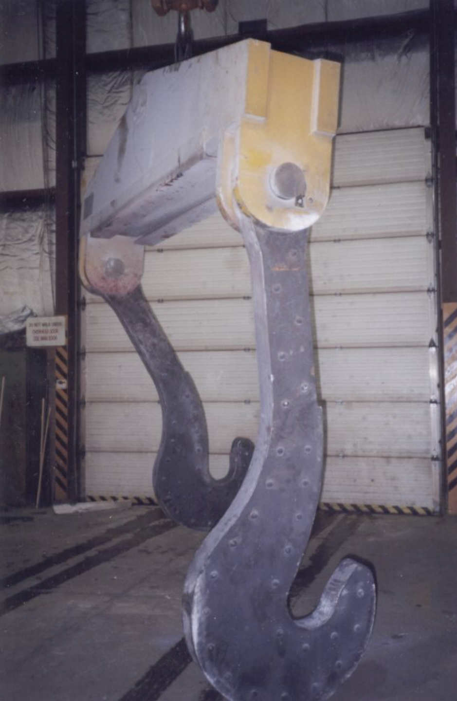
Beam with single-direction pivoting hooks.