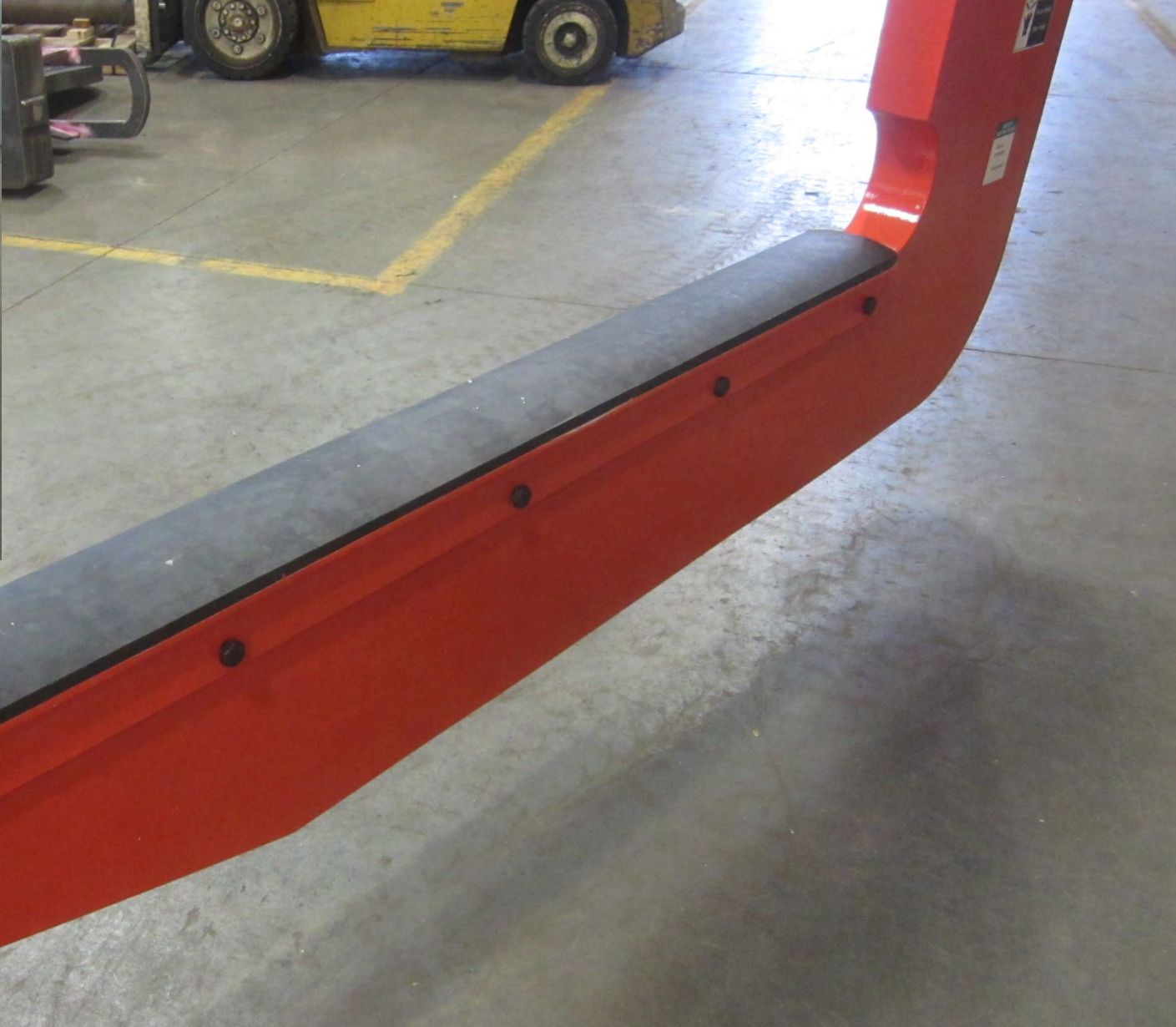
Bolt-on bonded rubber C-hook saddle