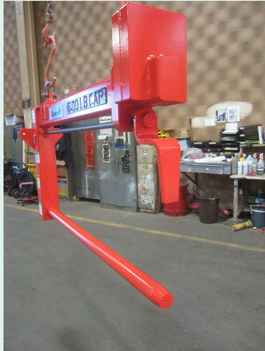
Load retainer engaged