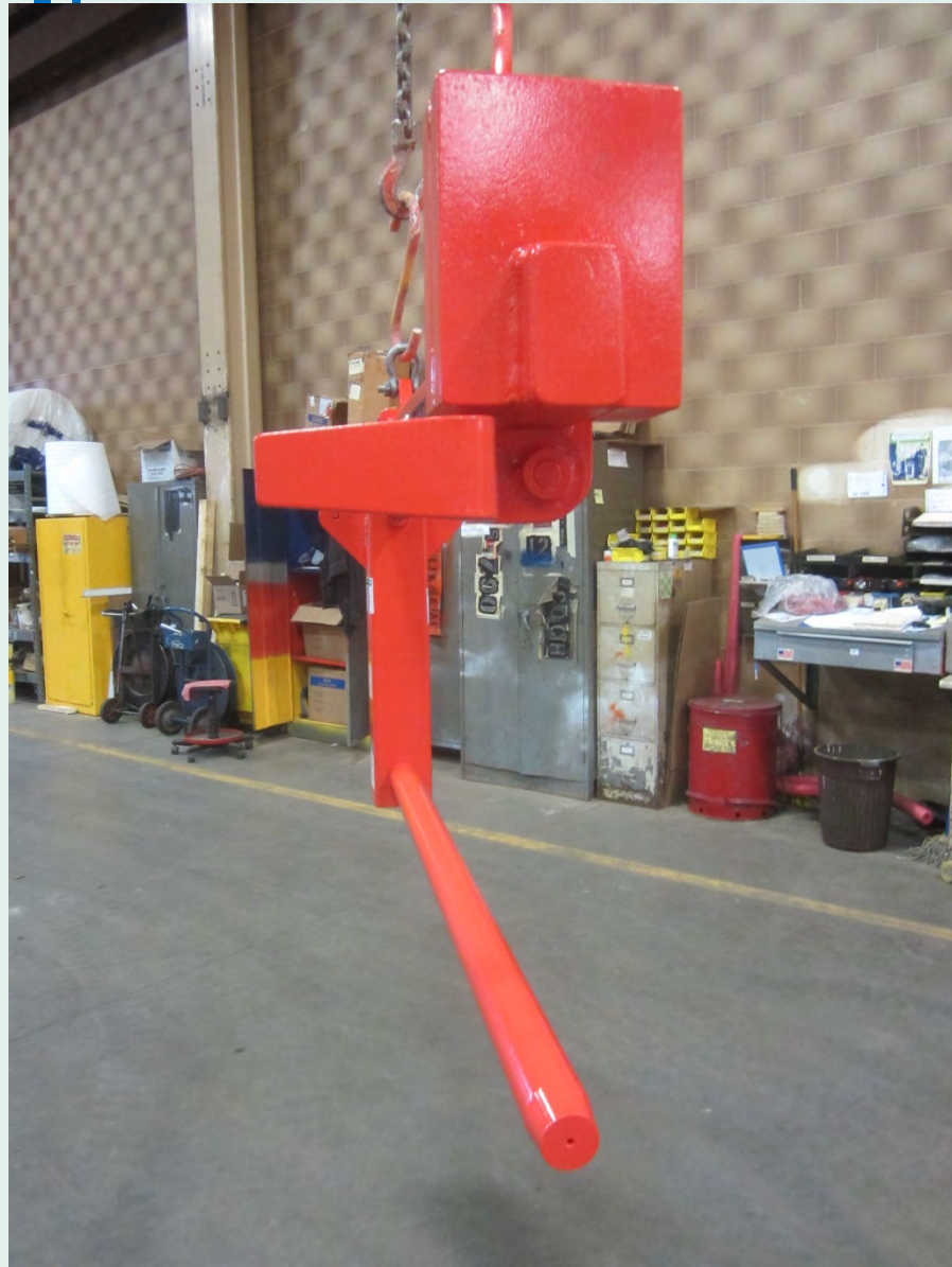
Load retainer released