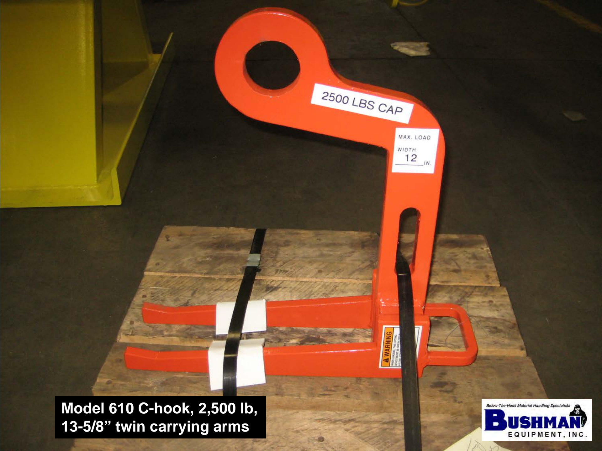
Model 610 C-hook, 2,500 lb, 13-5/8" twin carrying arms