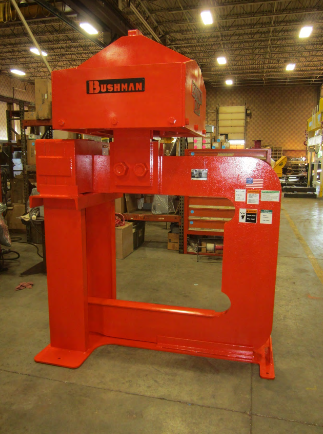
30 ton motorized rotating C-Hook in storage stand