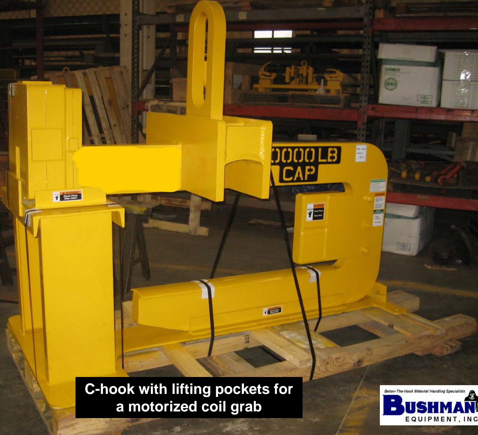
C-hook with lifting pockets for a motorized coil grab