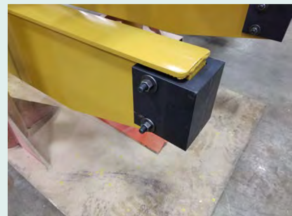
20 MT C-hook with machined Nylatron bolt-on bumper pads