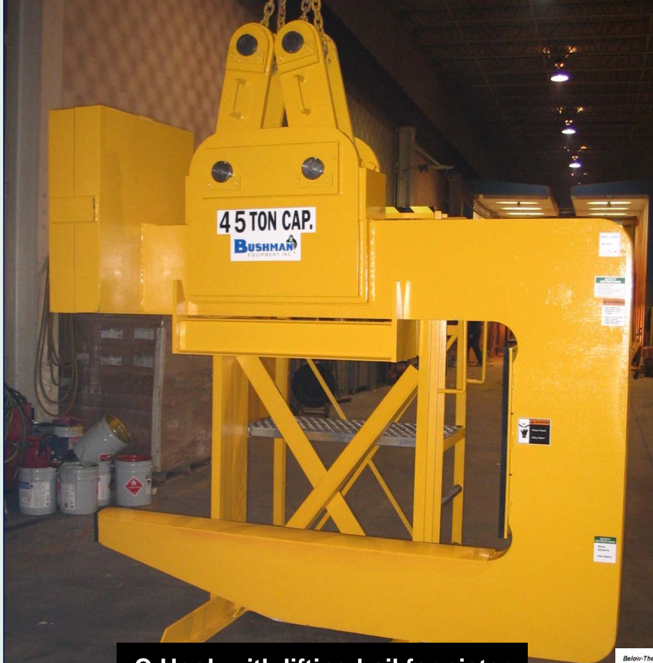
C-Hook with lifting bail for sister hook and maintenance stand