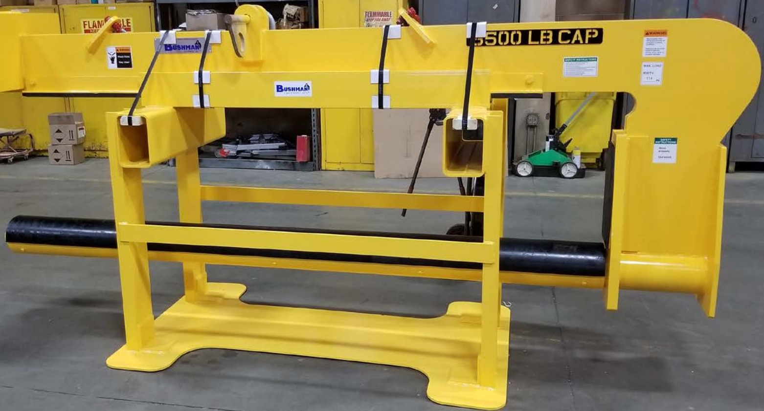
4.25 ton C-hook lifting wire spools