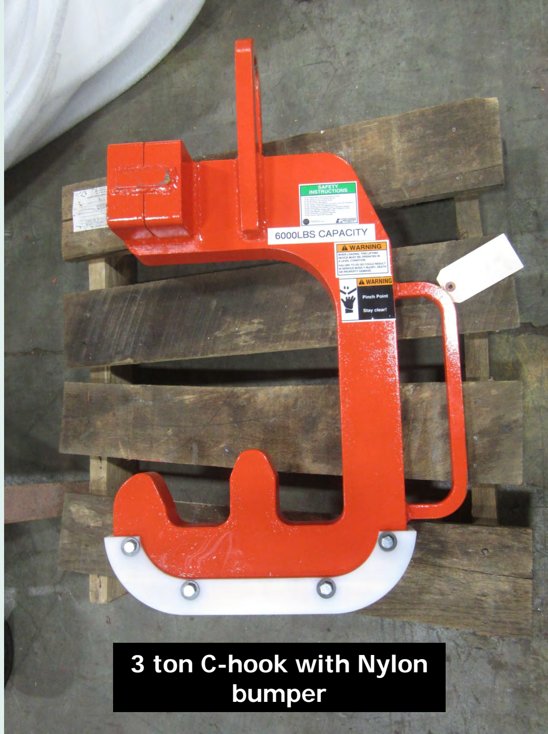
3 ton C-hook with Nylon bumper