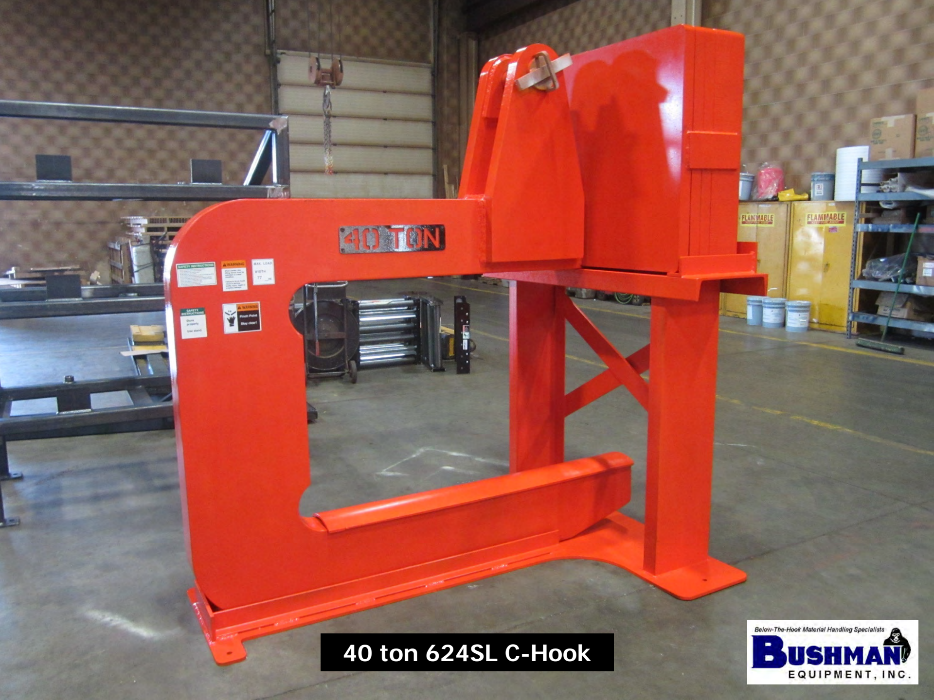
40 ton 624SL C-Hook