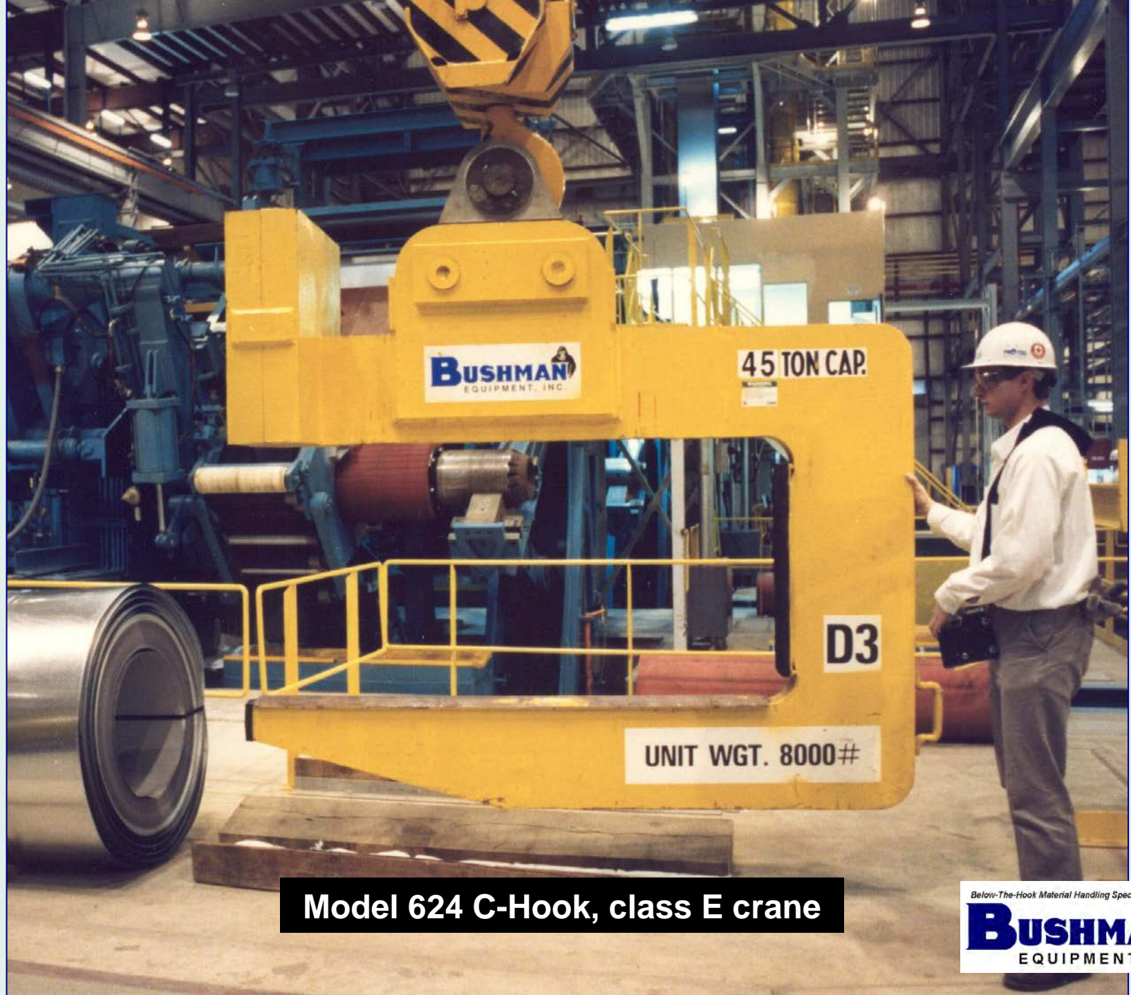
Model 624 C-Hook, class E crane