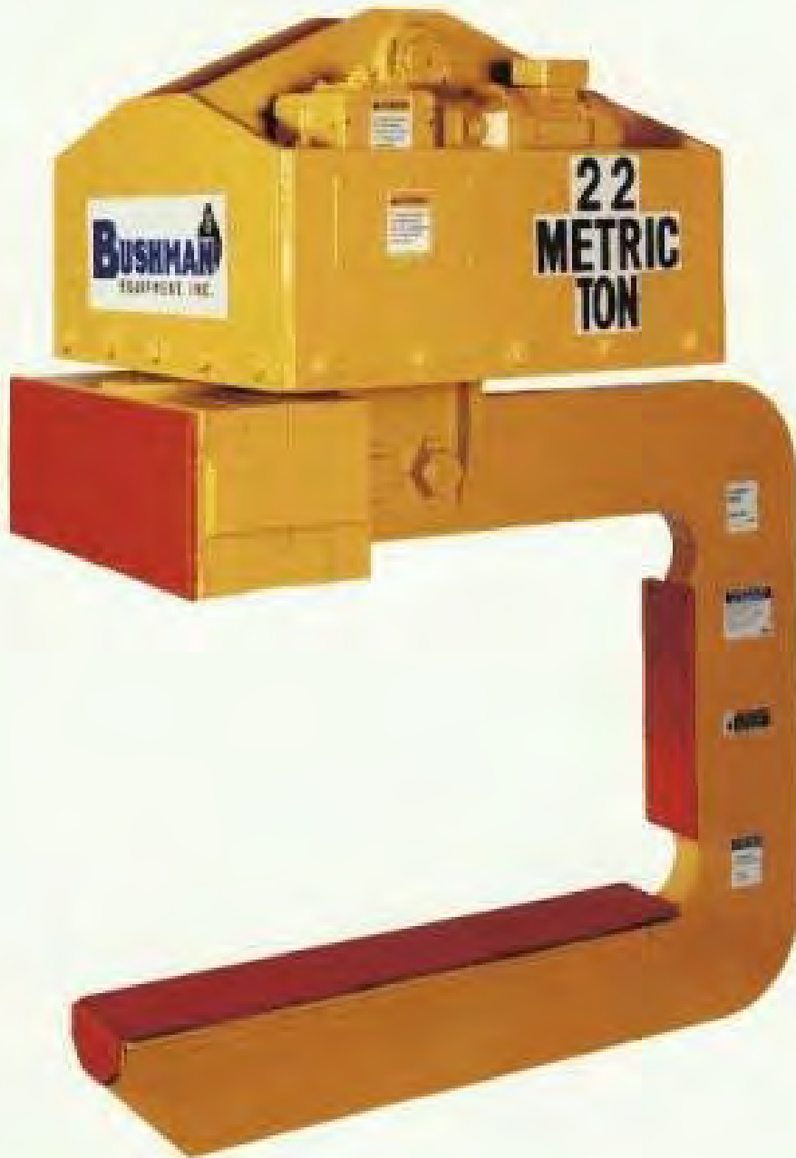
C-Hook with power rotation