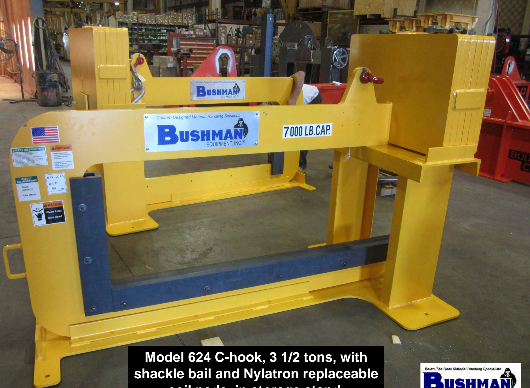
Model 624 C-hook, 3 1/2 tons, with shackle bail and Nylatron replaceable coil pads, in storage stand.