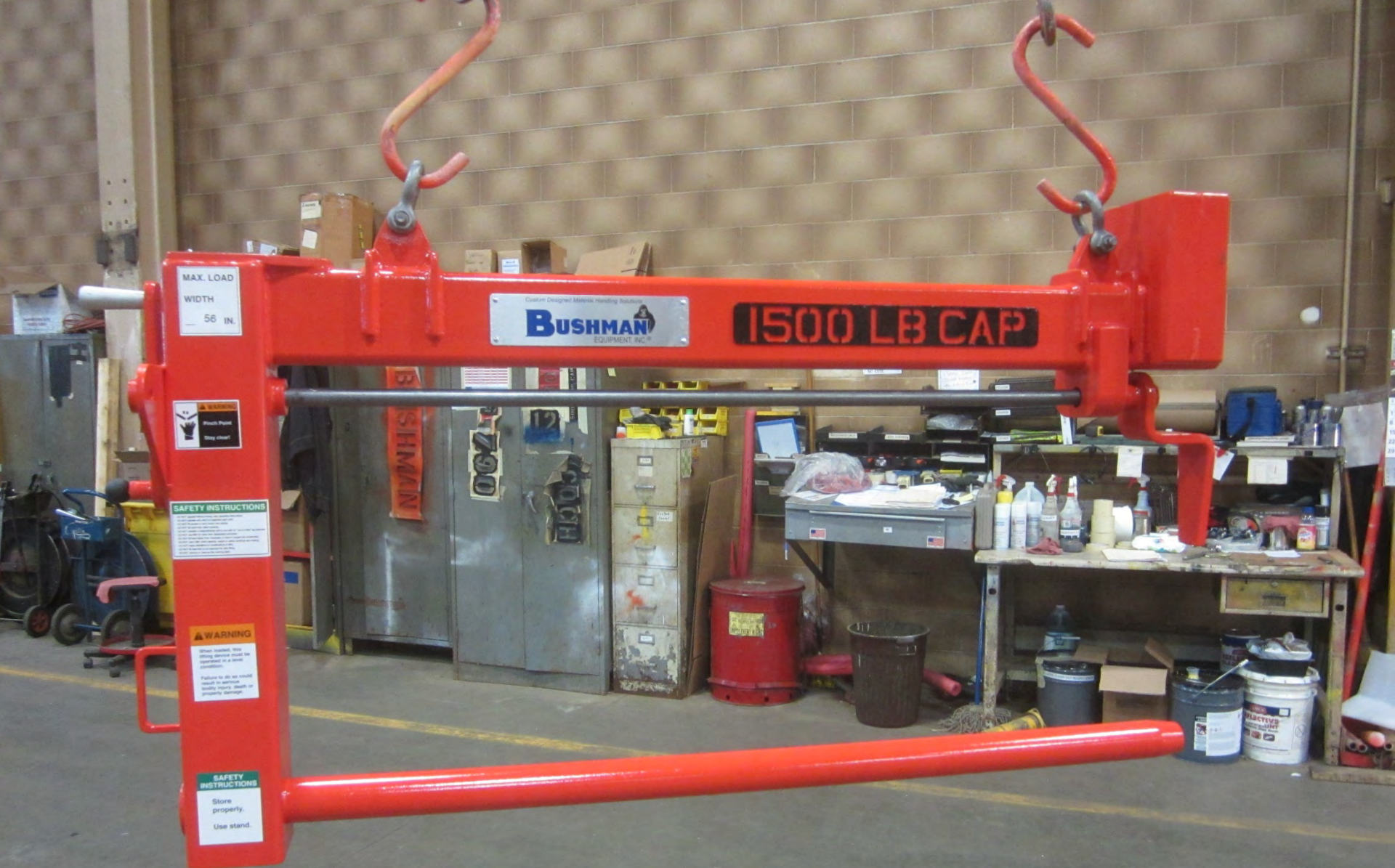
1,500 lb capacity Model 600 C-hook with load retainer