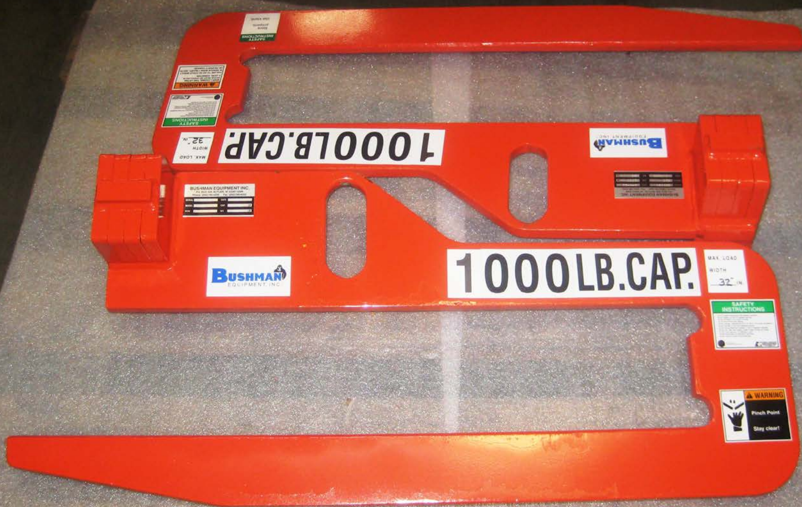
Model 610 C-hook, ½ ton capacity with integral bail.