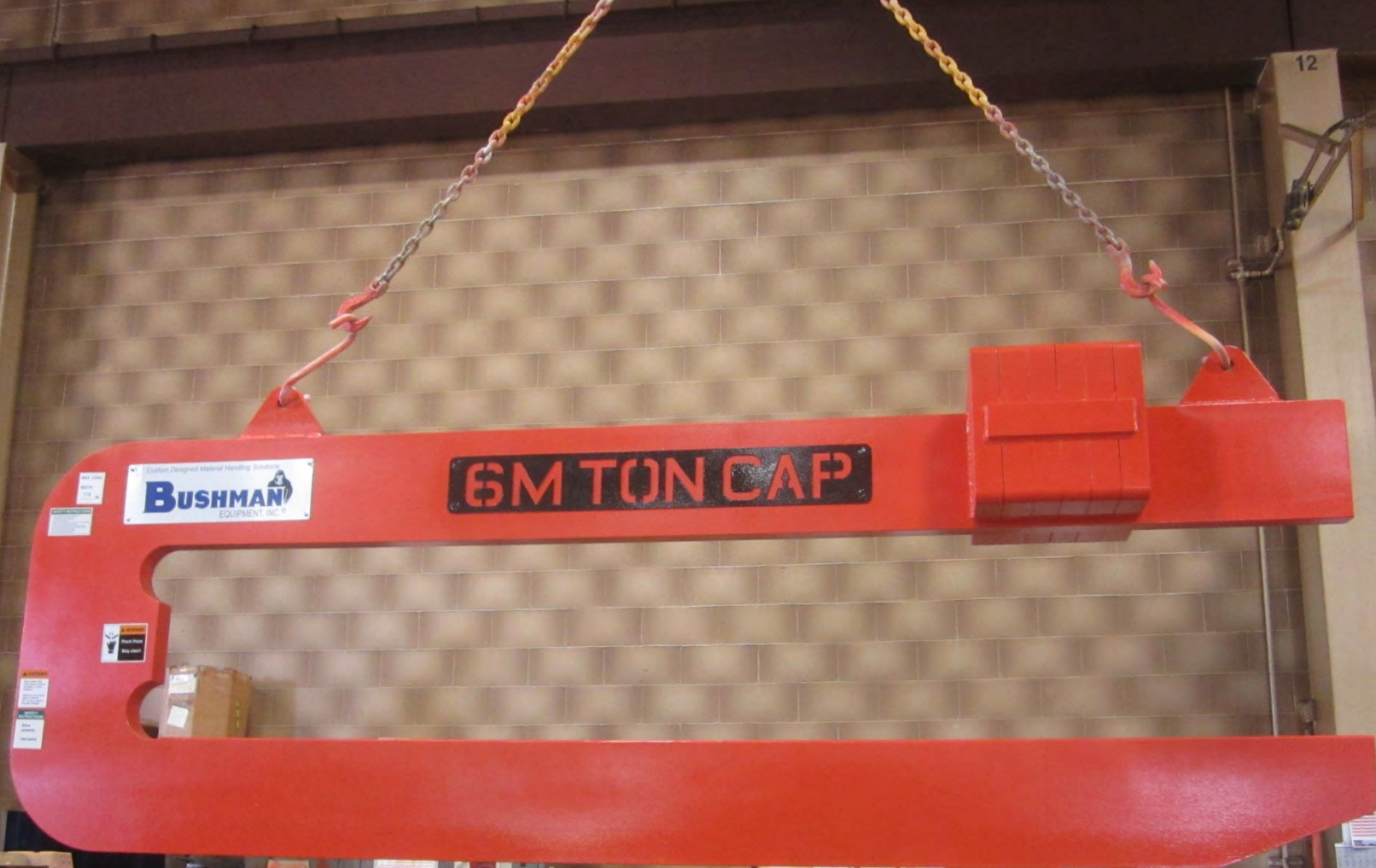
6 ton Model 624 C-hook with twin shackle hole lifting bails