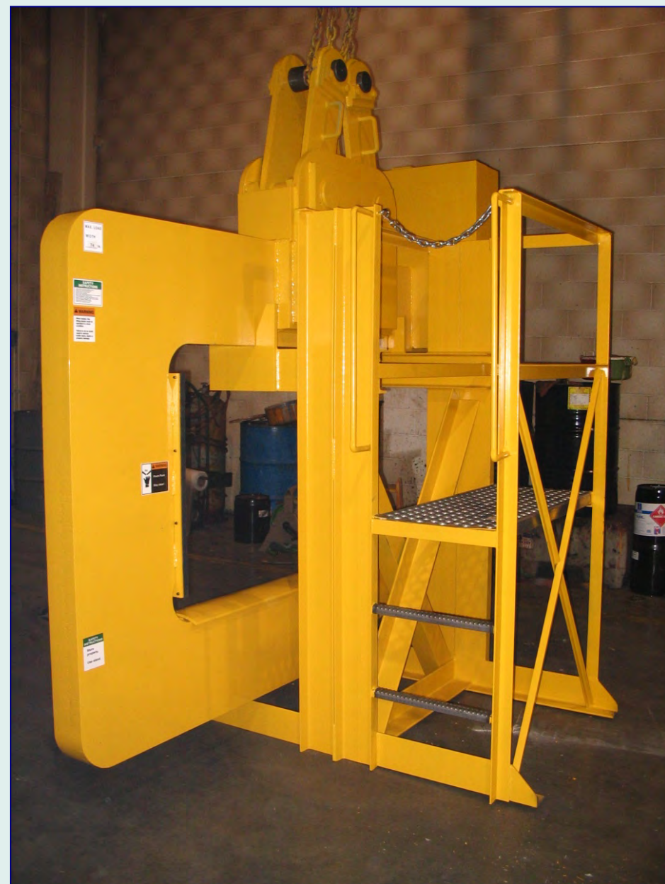
C-Hook with lifting bail for sister hook and maintenance stand