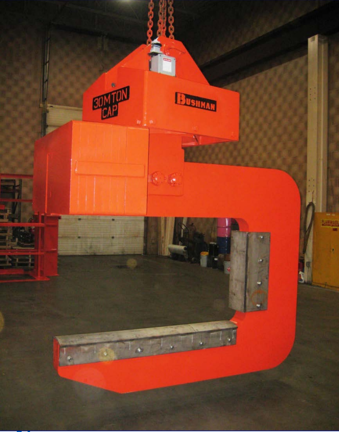
C-Hook with power rotation