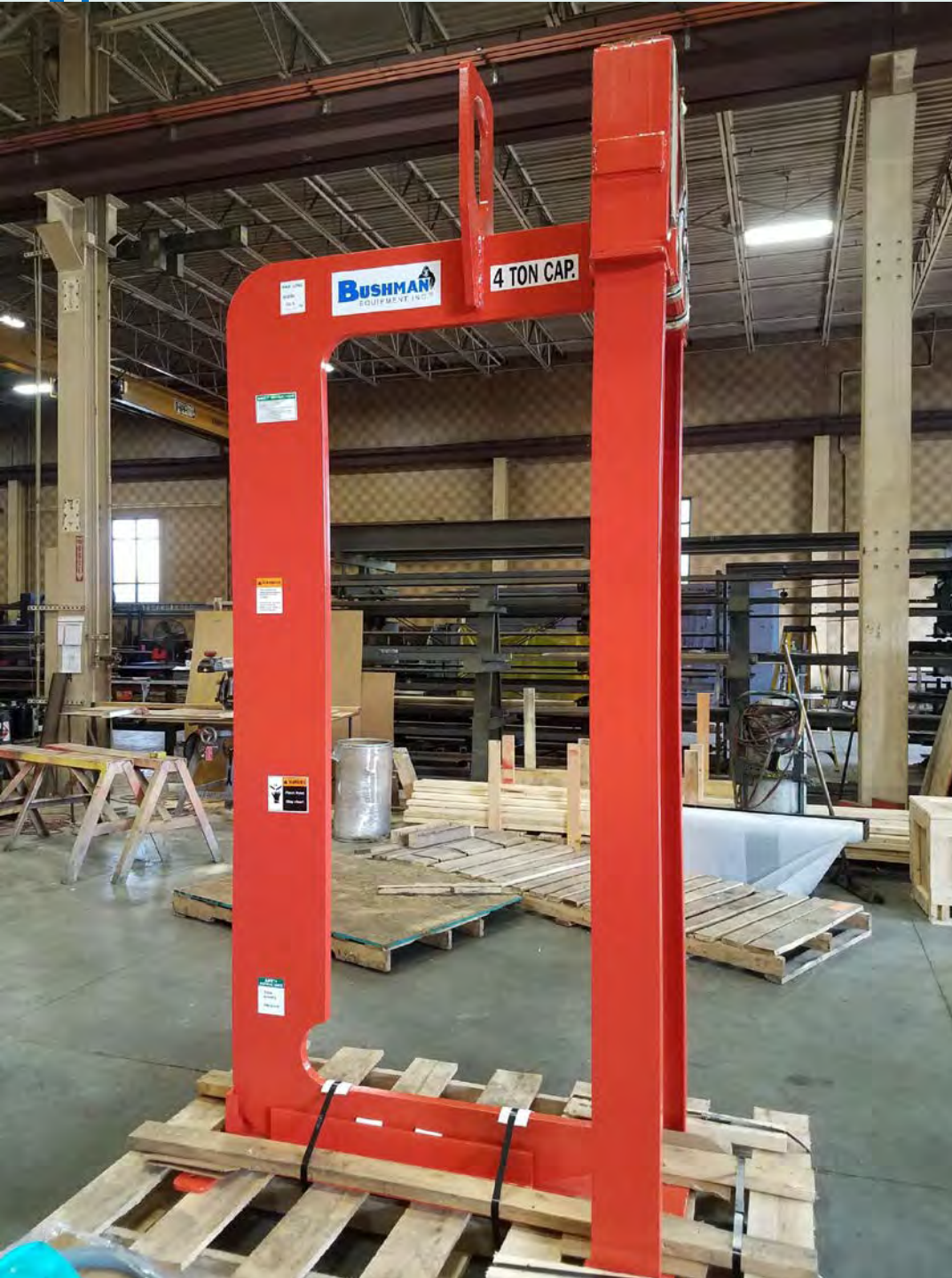
4 ton C-hook with large height