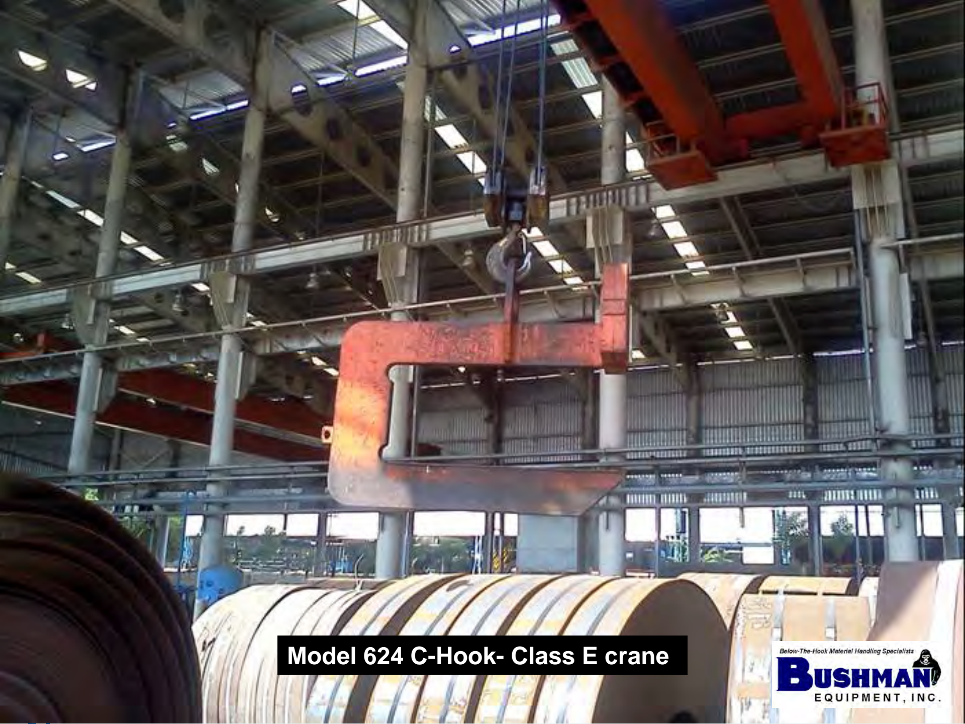
Model 624 C-Hook- Class E crane