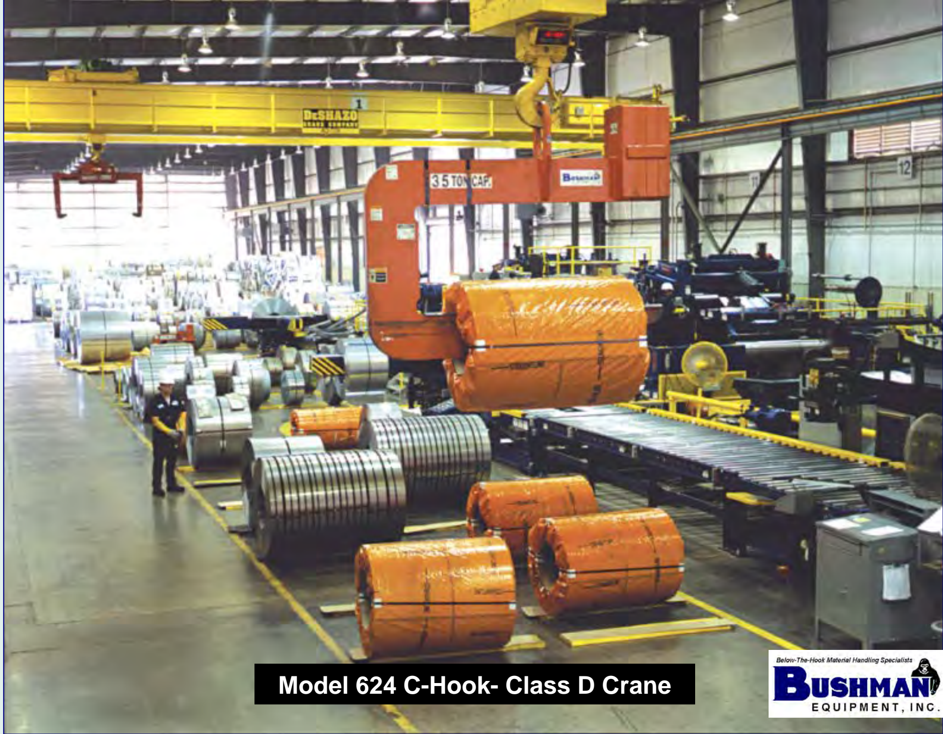
Model 624 C-Hook- Class D Crane