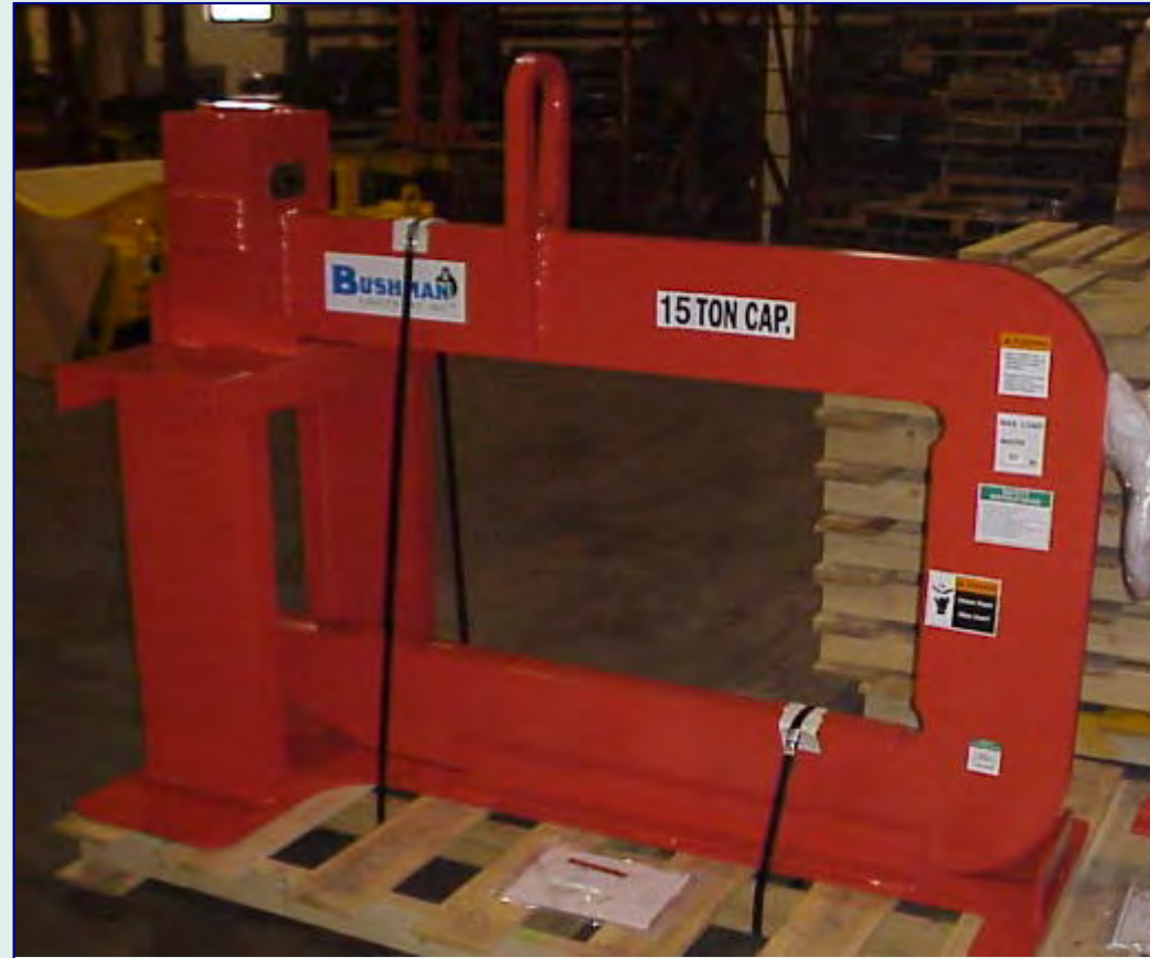
C-Hooks with Storage Stand