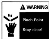
One at each corner